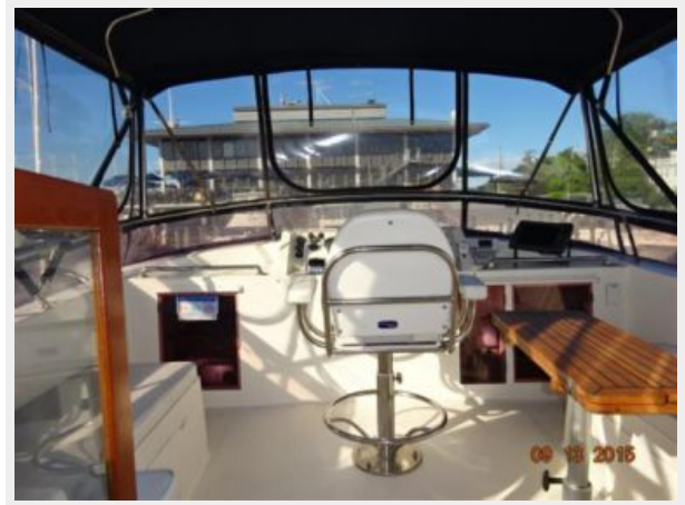
43' Marine Trader flybridge forward