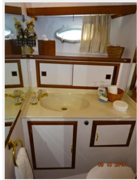
43' Marine Trader guest stateroom head