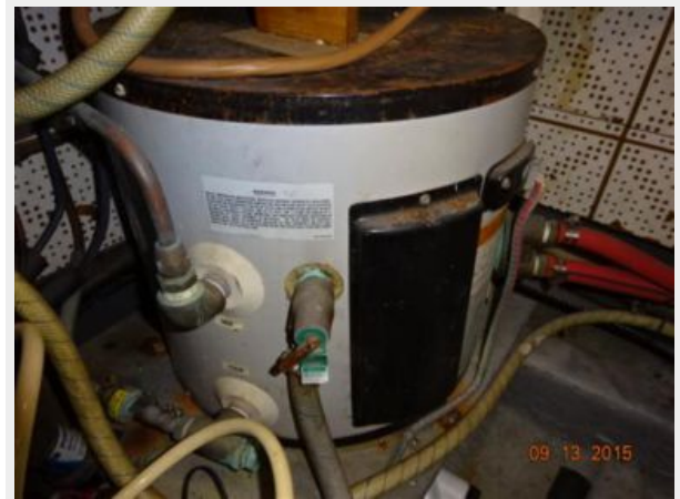
43' Marine Trader water heater