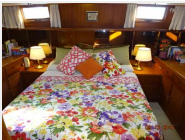
43' Marine Trader master stateroom