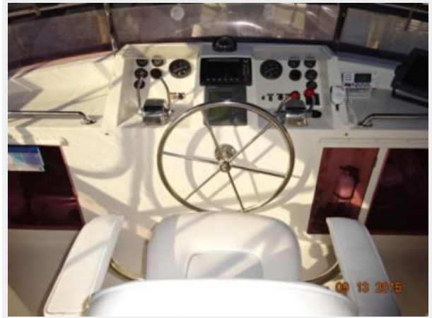
43' Marine Trader flybridge helm