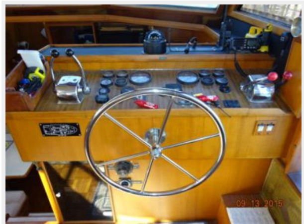
43' Marine Trader lower helm photo2