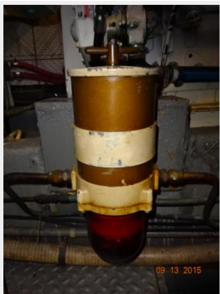
43' Marine Trader starboard Racor fuel filter