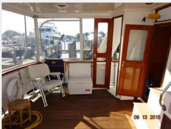
43' Marine Trader sundeck starboard