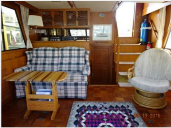
43' Marine Trader salon aft