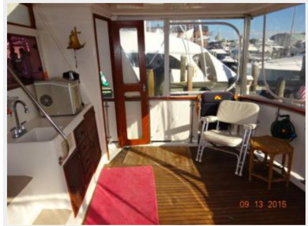
43' Marine Trader sundeck port