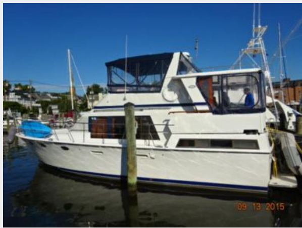
43' Marine Trader port profile