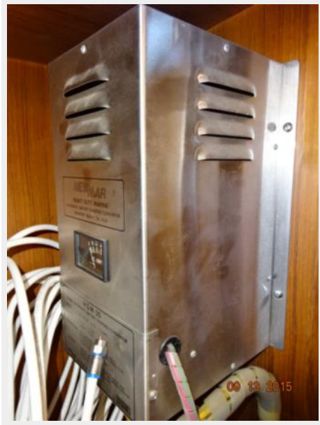
43' Marine Trader battery charger