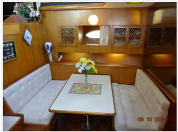
43' Marine Trader dinette photo2