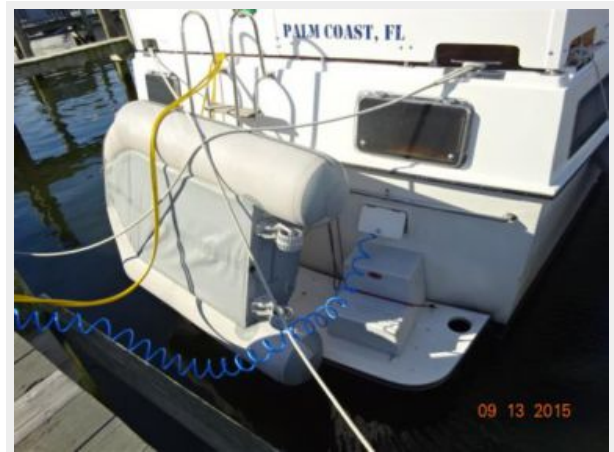
43' Marine Trader tender