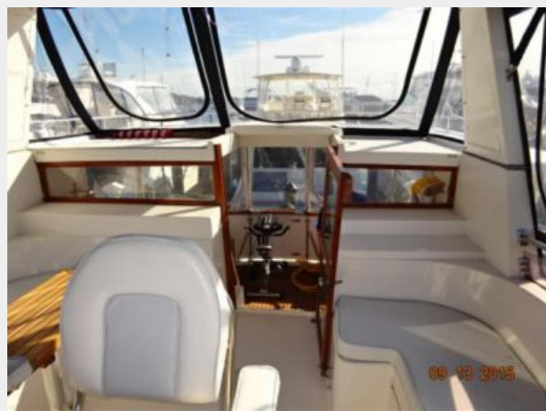
43' Marine Trader flybridge aft