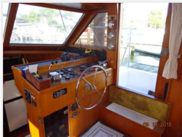
43' Marine Trader lower helm photo1