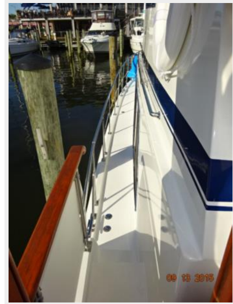
43' Marine Trader port side deck photo1