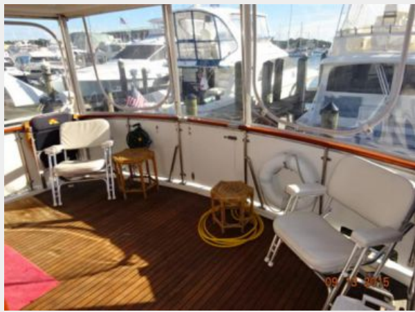
43' Marine Trader sundeck photo2