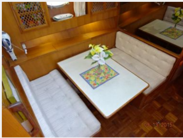
43' Marine Trader dinette photo1