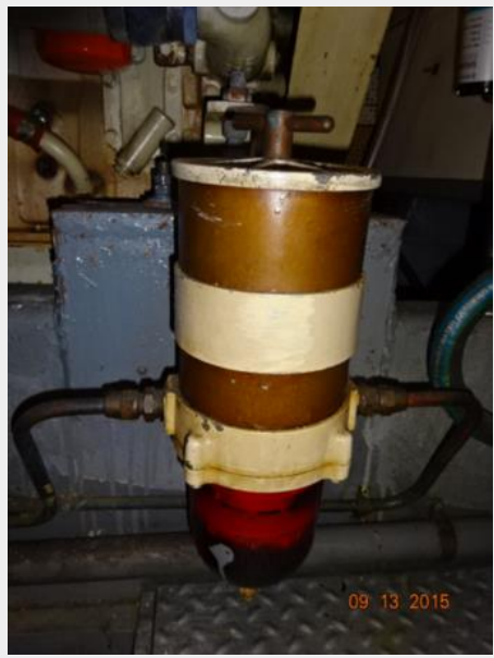
43' Marine Trader port Racor fuel filter