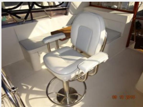
43' Marine Trader flybridge helmseat