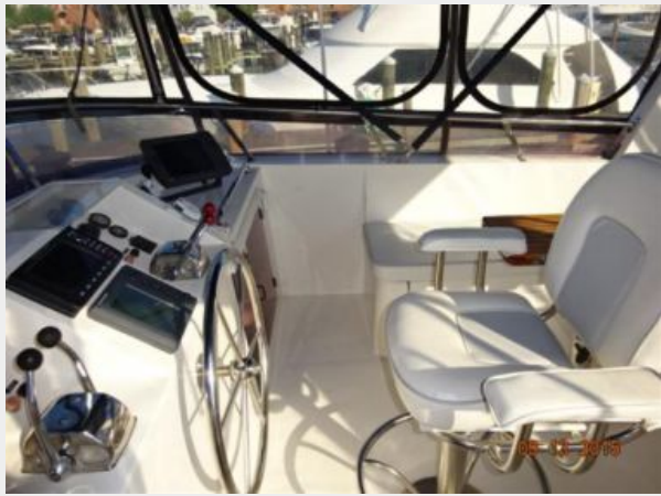
43' Marine Trader flybridge starboard