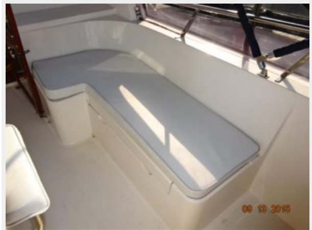
43' Marine Trader flybridge port seating