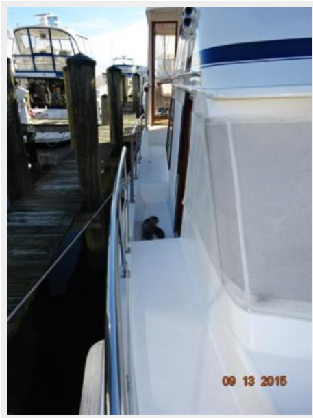
43' Marine Trader starboard side deck photo2