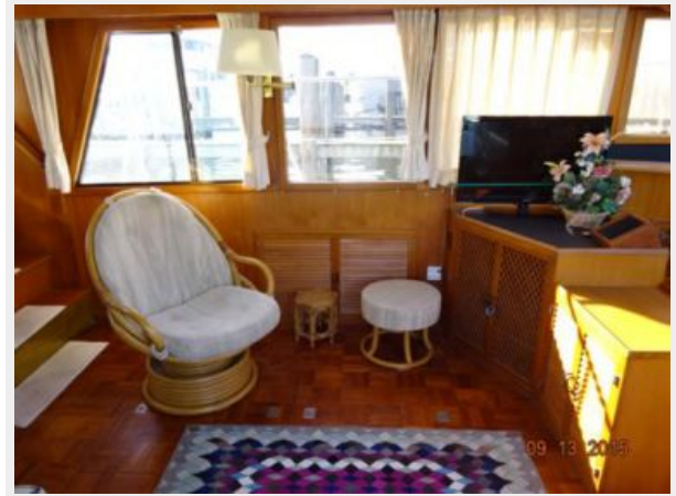
43' Marine Trader salon port