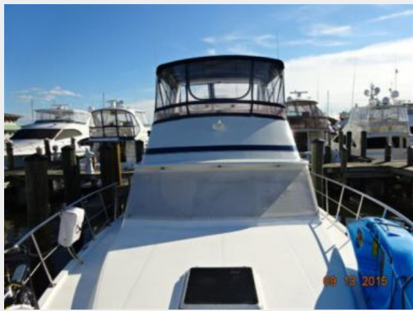
43' Marine Trader foredeck aft