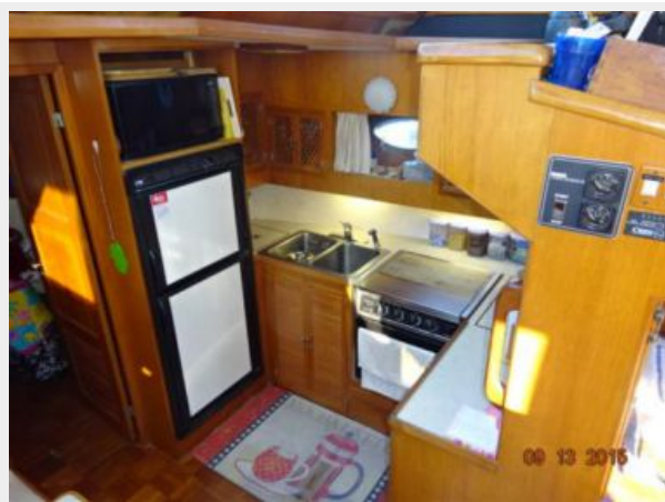
43' Marine Trader galley photo1