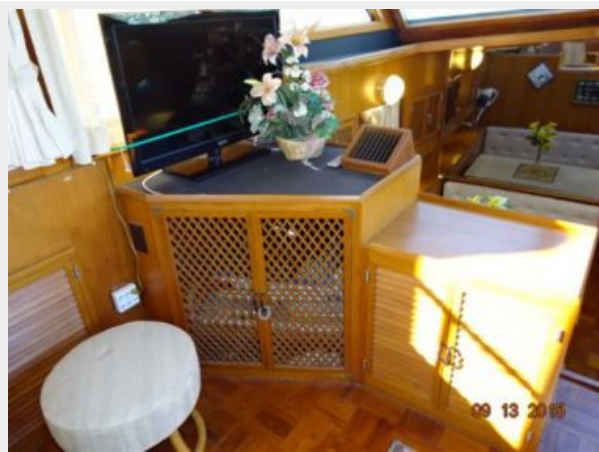
43' Marine Trader salon port forward