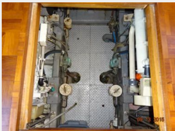
43' Marine Trader engine room access