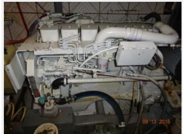
43' Marine Trader starboard main engine