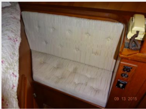
43' Marine Trader guest stateroom benchseat