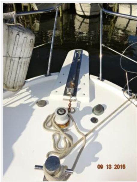
43' Marine Trader anchor windlass