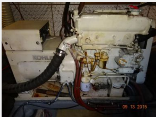
43' Marine Trader generator