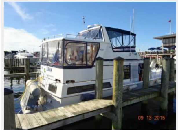
43' Marine Trader starboard aft profile