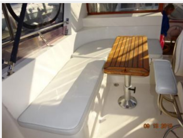
43' Marine Trader flybridge starboard seating