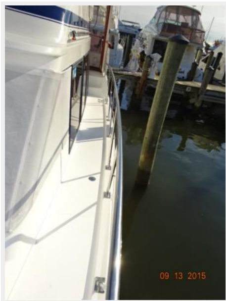
43' Marine Trader port side deck photo2