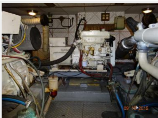
43' Marine Trader engine room aft