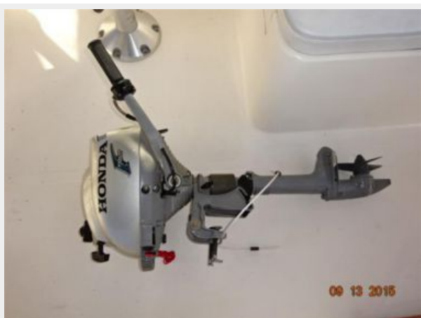
43' Marine Trader tender outboard