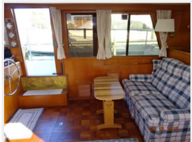
43' Marine Trader salon starboard