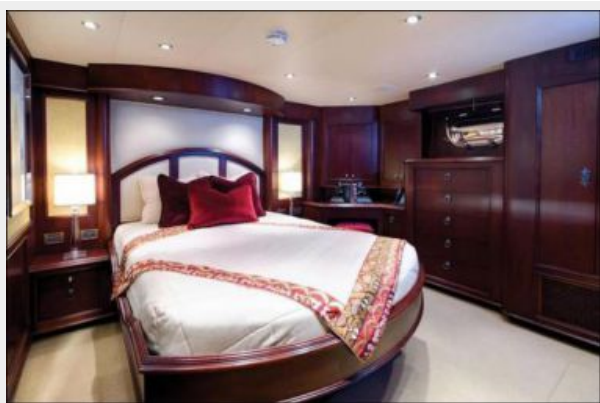
Aft Queen Guest Stateroom