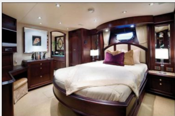
Port VIP Stateroom