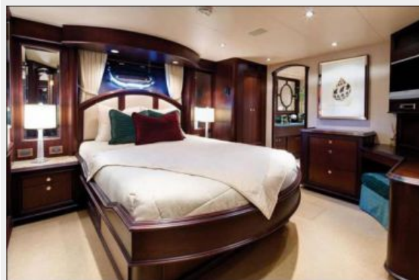
Starboard VIP Stateroom