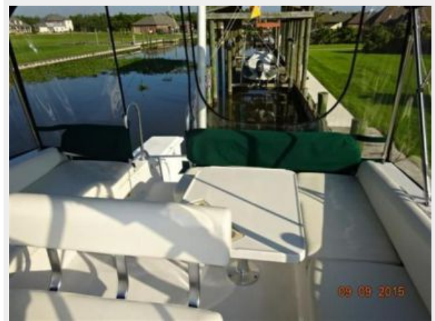
43' Mainship flybridge aft