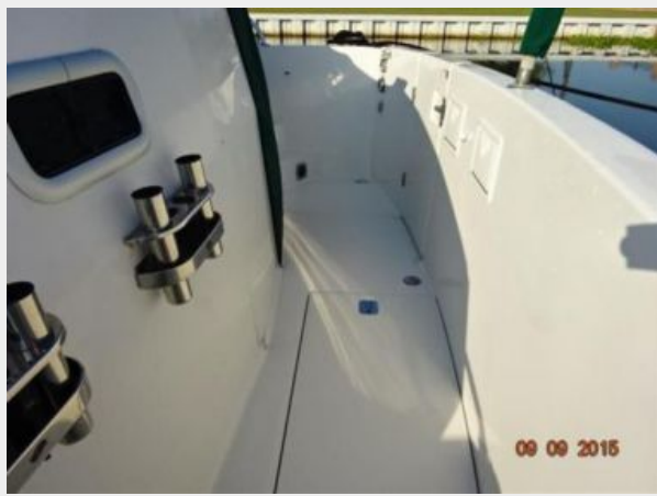
43' Mainship cockpit starboard