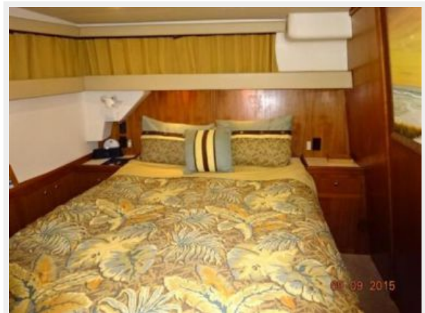
43' Mainship master stateroom port