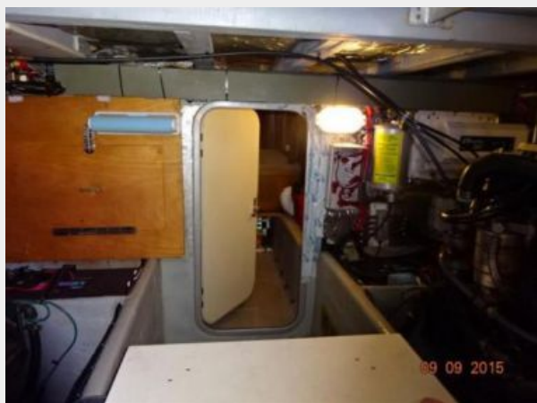
43' Mainship engine room forward