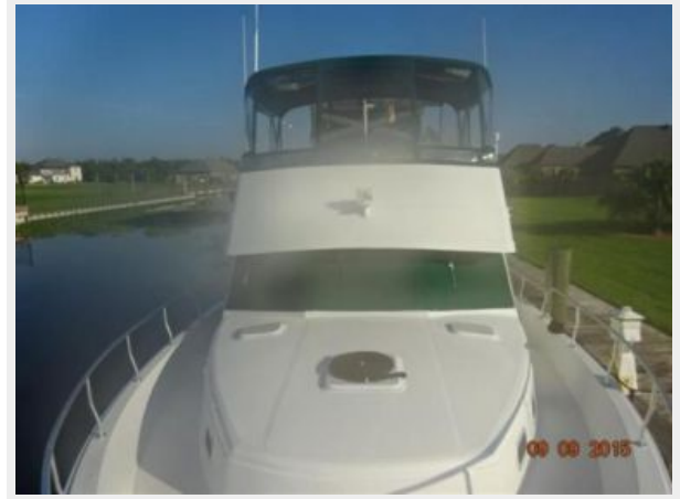
43' Mainship foredeck aft