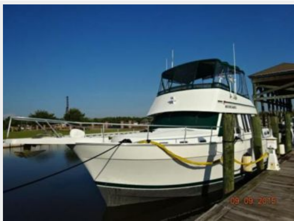
43' Mainship port forward profile