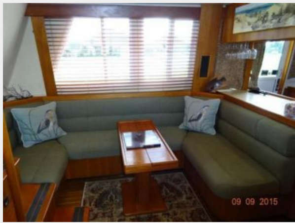
43' Mainship salon port