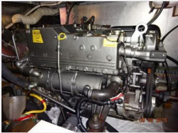
43' Mainship port main engine