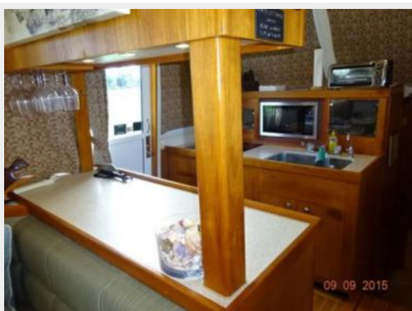
43' Mainship galley photo1