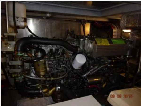
43' Mainship starboard main engine