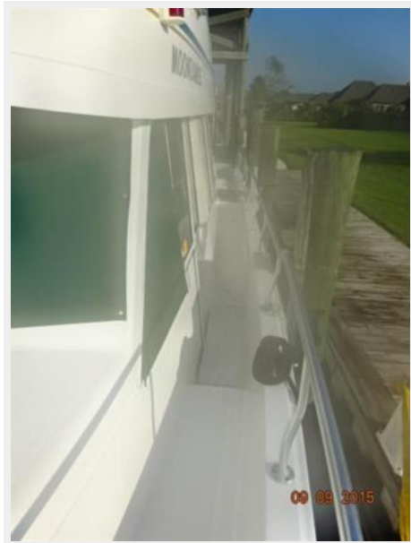
43' Mainship port side deck photo1