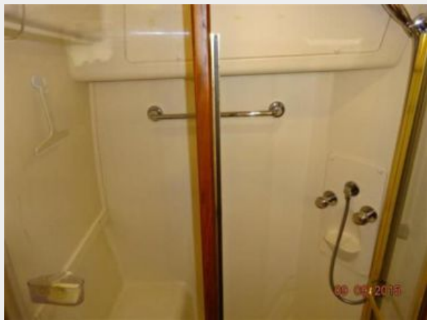
43' Mainship guest shower