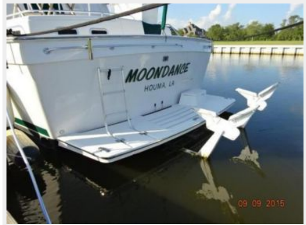
43' Mainship swimplatform