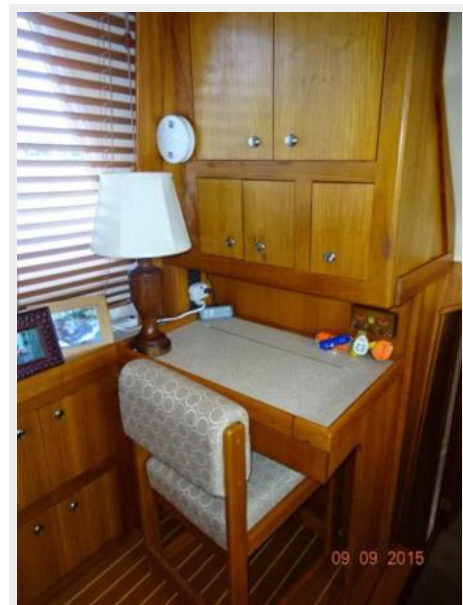
43' Mainship salon desk