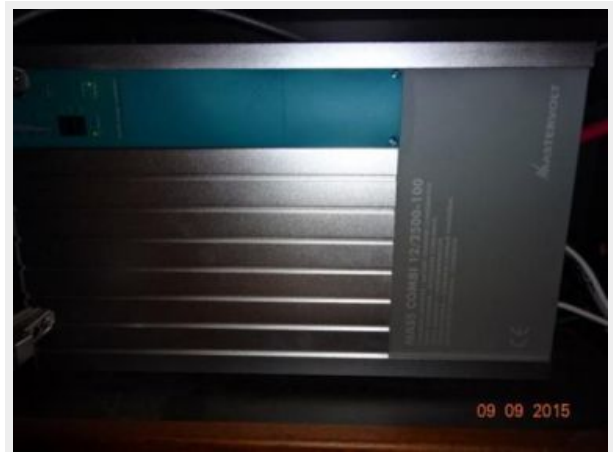
43' Mainship inverter