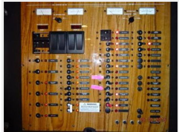
43' Mainship electrical panel