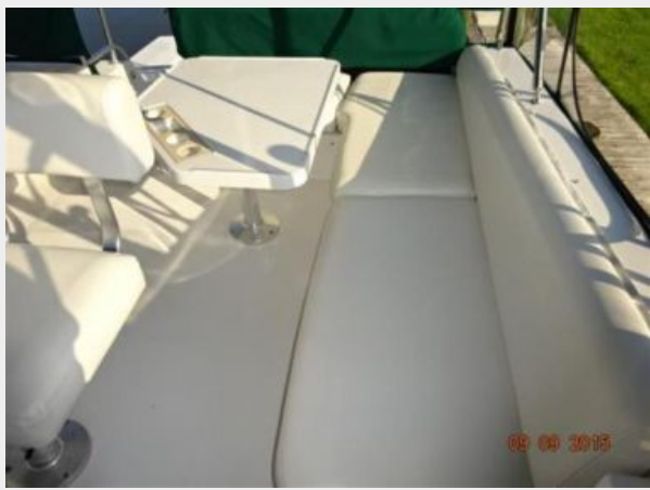
43' Mainship flybridge port seating photo1