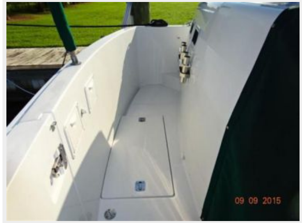
43' Mainship cockpit port