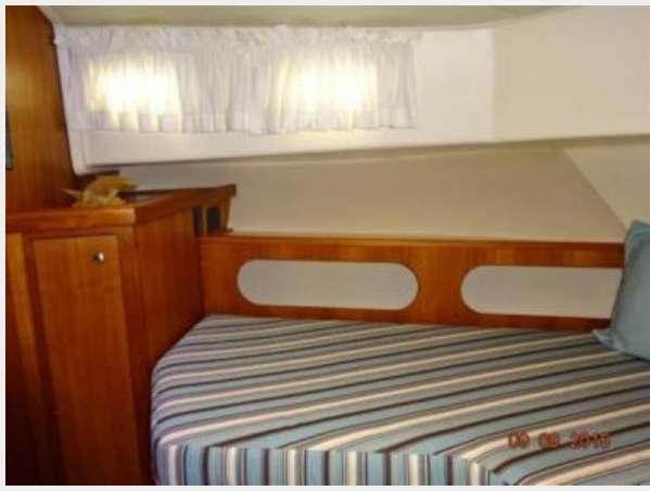
43' Mainship forward guest stateroom port