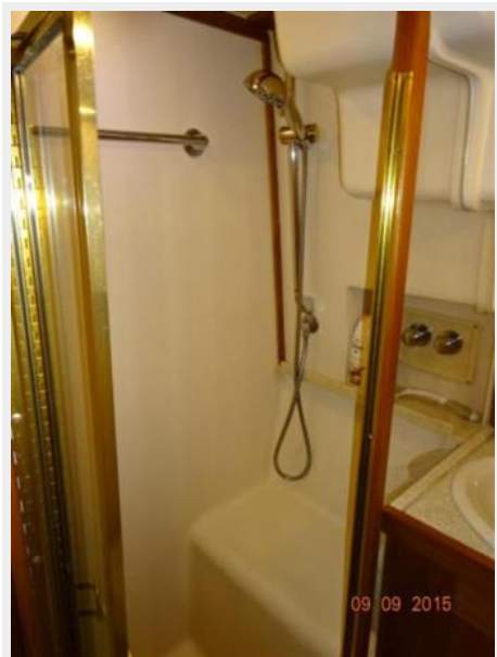
43' Mainship master stateroom shower