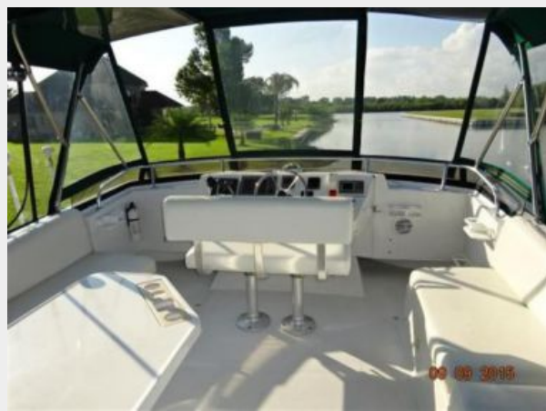
43' Mainship flybridge forward