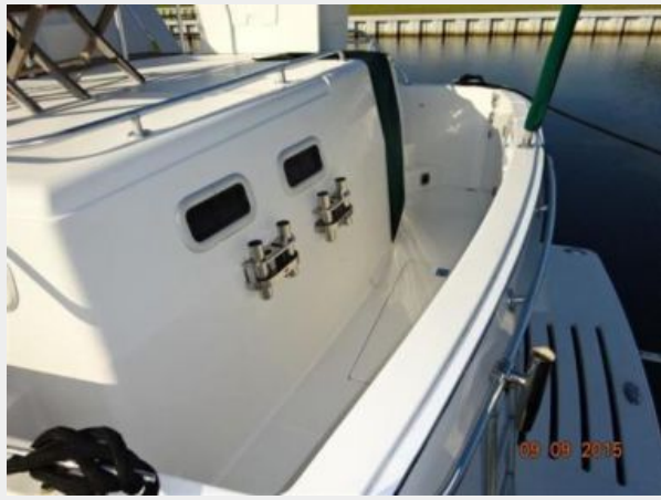
43' Mainship cockpit