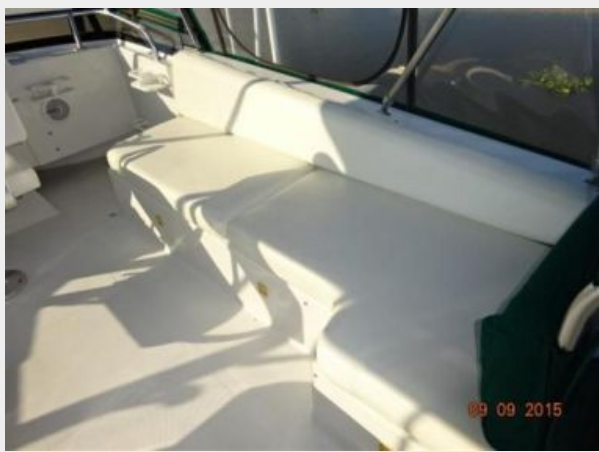
43' Mainship flybridge starboard seating