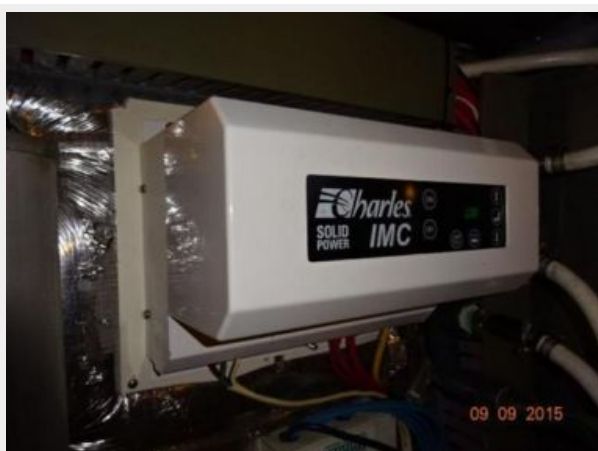
43' Mainship battery charger