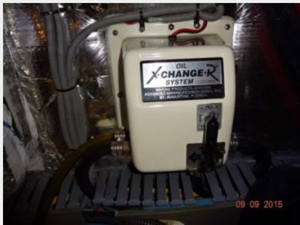
43' Mainship oil change system