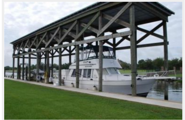
43' Mainship starboard forward profile photo2