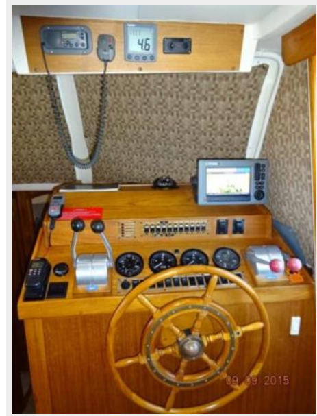
43' Mainship lower helm photo2