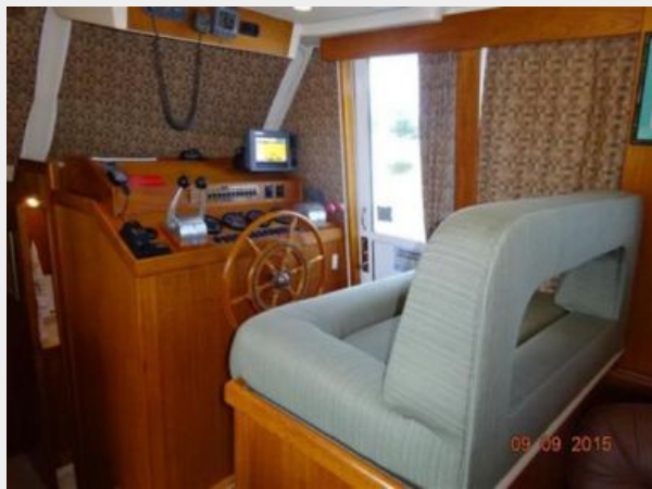
43' Mainship lower helm photo1