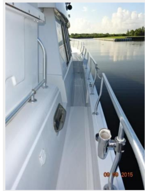
43' Mainship starboard side deck photo2