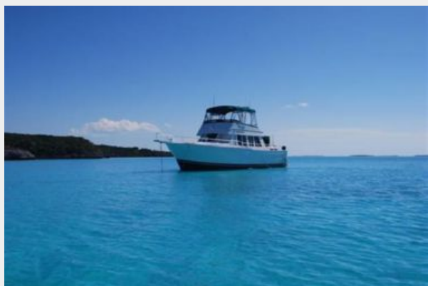
43' Mainship at anchor