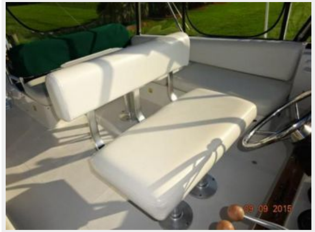
43' Mainship flybridge helmseat