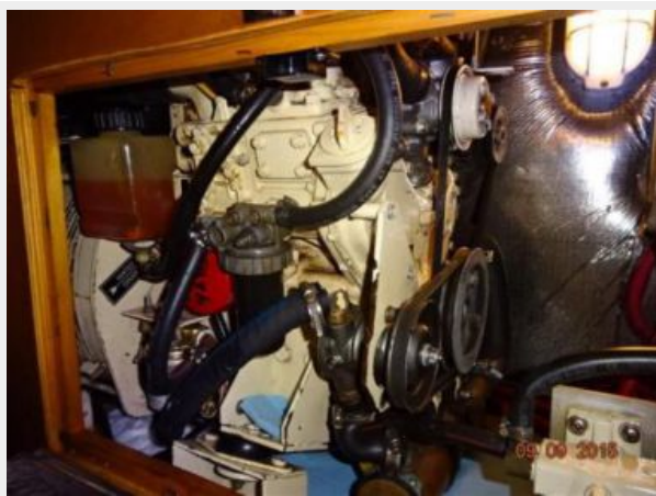
43' Mainship generator