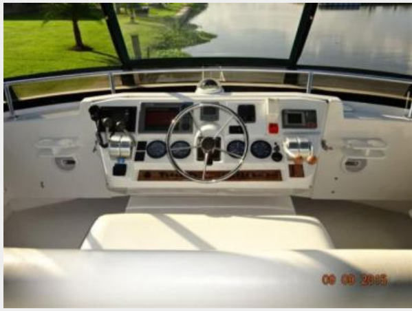
43' Mainship flybridge helm