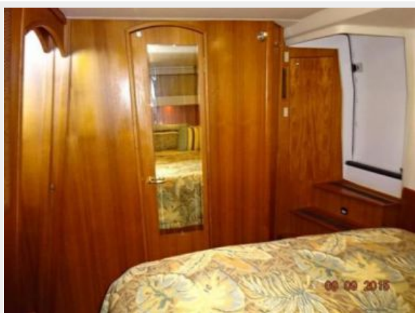
43' Mainship master stateroom starboard