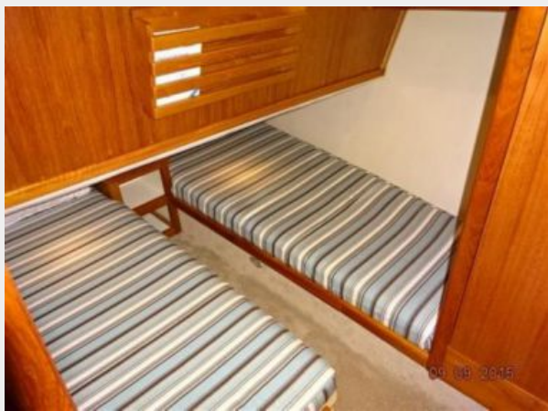
43' Mainship port guest stateroom