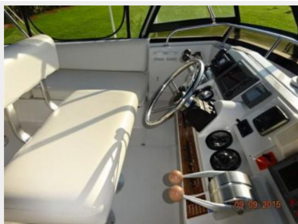
43' Mainship flybridge port