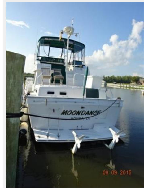
43' Mainship aft profile