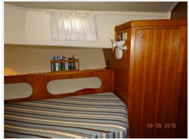
43' Mainship forward guest stateroom starboard