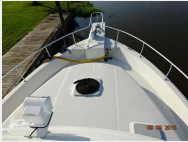
43' Mainship foredeck