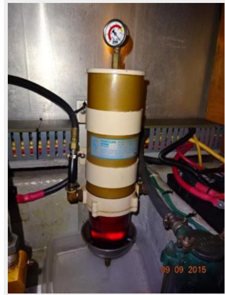
43' Mainship port Racor fuel filter