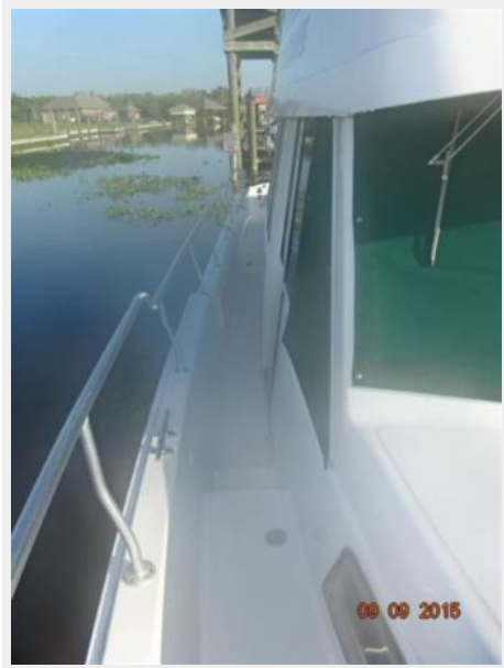
43' Mainship starboard side deck photo1