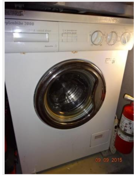
43' Mainship washer-dryer