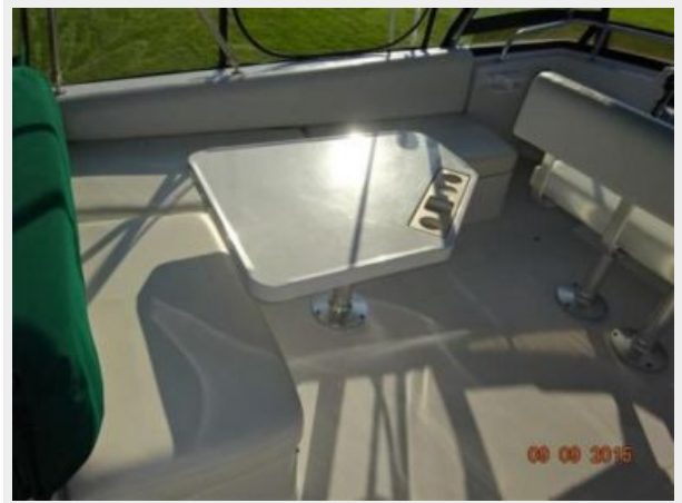
43' Mainship flybridge port seating photo2