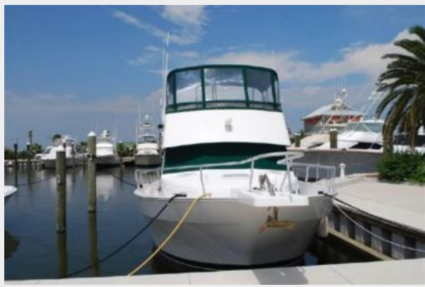
43' Mainship forward profile