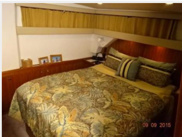
43' Mainship master stateroom