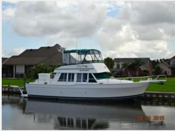
43' Mainship starboard forward profile photo1