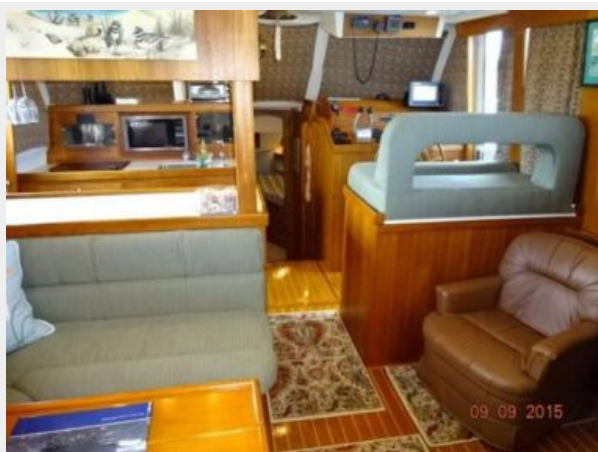
43' Mainship salon forward