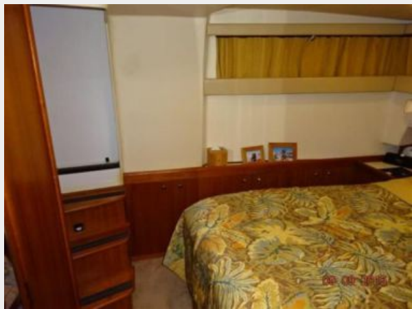
43' Mainship master stateroom aft