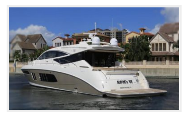
Starboard Aft Profile