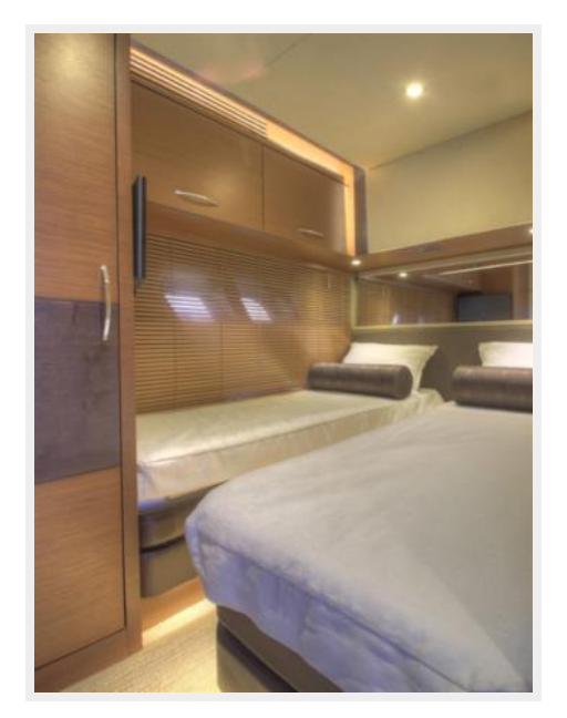
Mid Stateroom (3rd Stateroom - Starboard) (2)