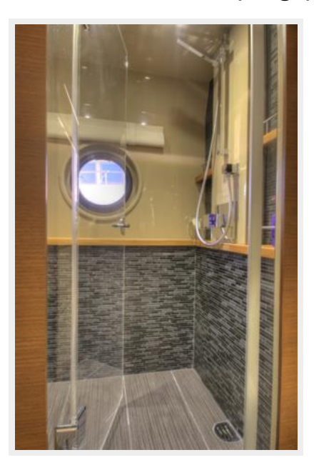
Bow VIP Stateroom