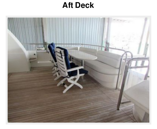
Aft Deck Wet Bar