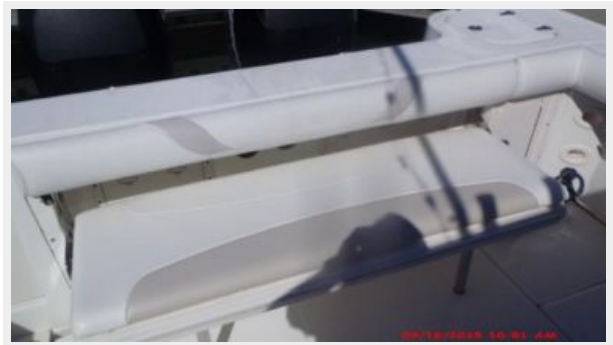
Cockpit / Fishing Equipment 1