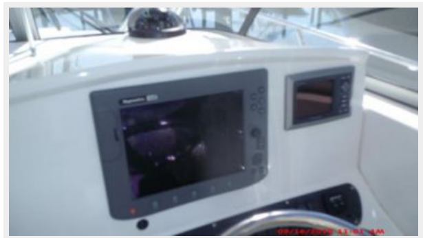
Helm / Electronics & Navigation 2