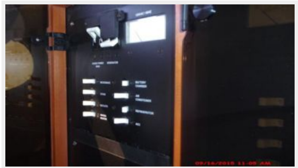
Electrical System / Equipment 2