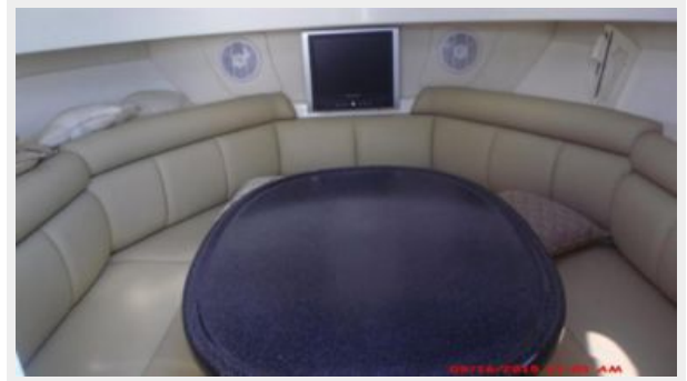
Main Cabin 1