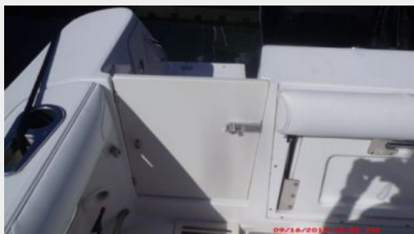
Cockpit / Fishing Equipment 2