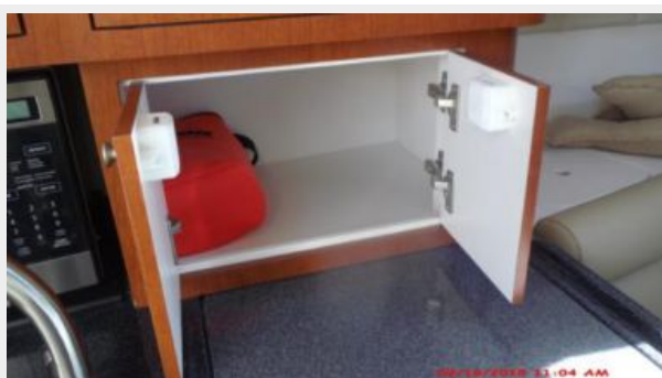
Main Cabin 4