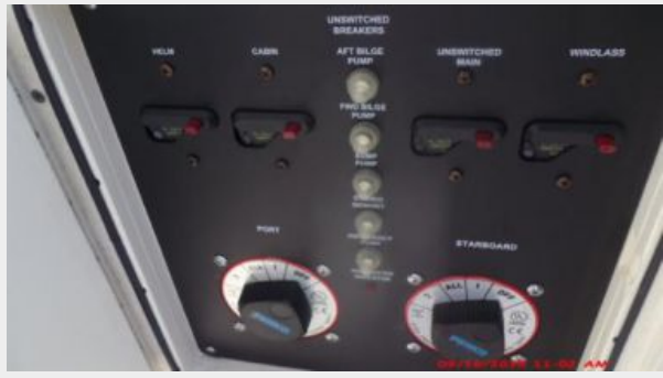
Engine & Mechanical Equipment 8