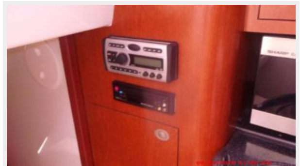
Main Cabin 3