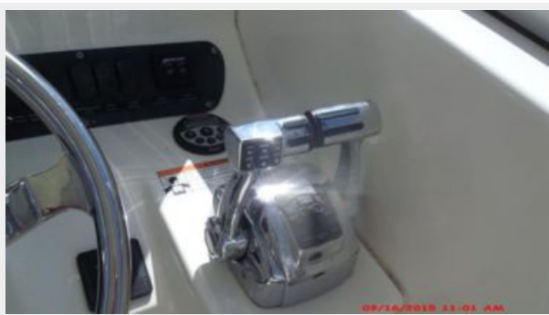
Helm / Electronics & Navigation 3