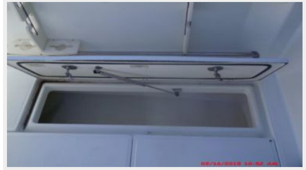
Cockpit / Fishing Equipment 5