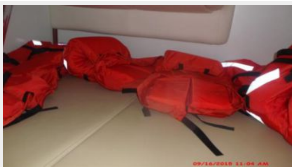
Main Cabin 2