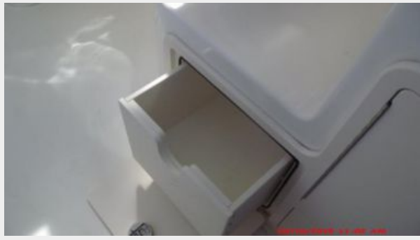
Cockpit / Fishing Equipment 4