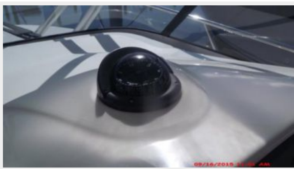
Helm / Electronics & Navigation 1