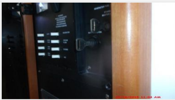
Electrical System / Equipment 1