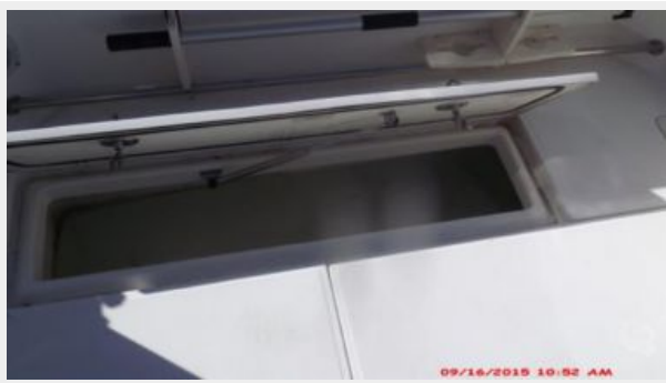
Cockpit / Fishing Equipment 6