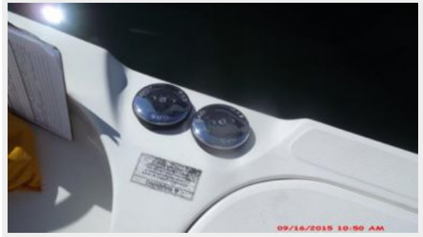
Engine & Mechanical Equipment 9