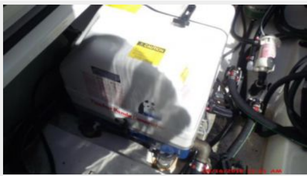
Electrical System / Equipment 3