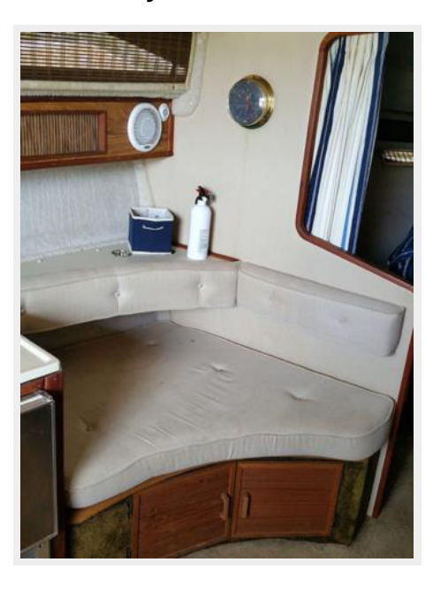
34' Sea Ray Salon Port Forward