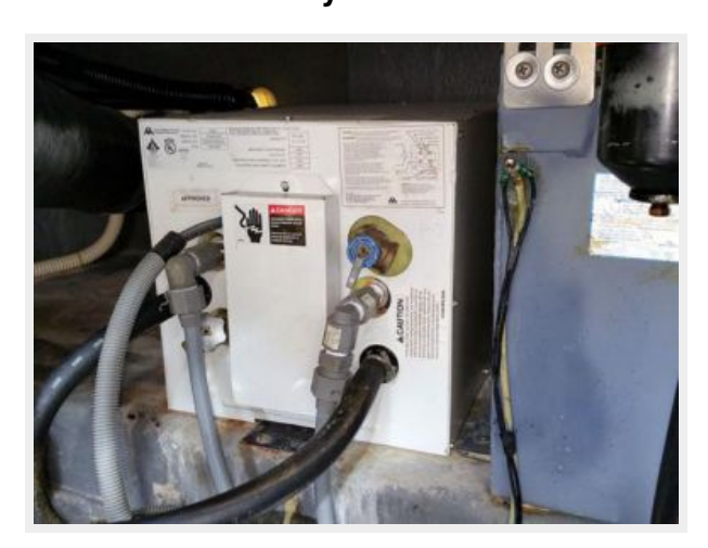
34' Sea Ray Water Heater