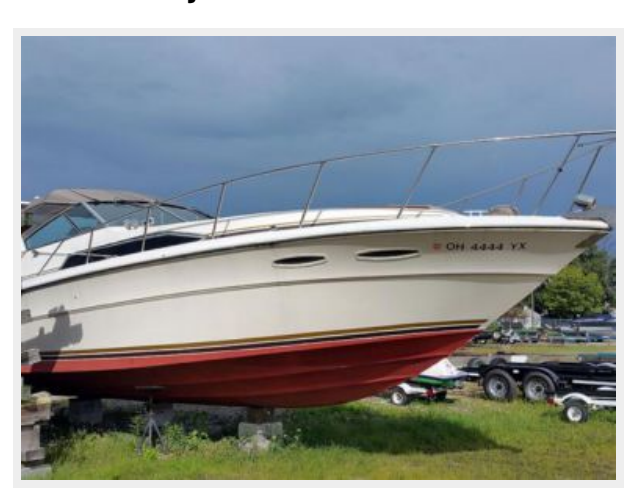
34' Sea Ray Starboard Forward Profile