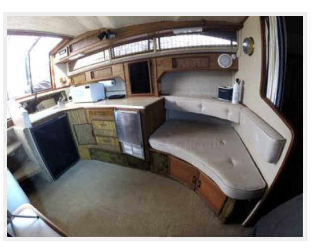
34' Sea Ray Salon Port