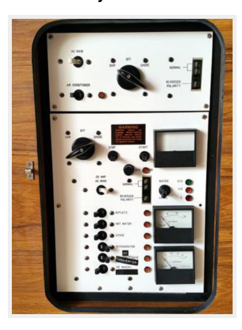
34' Sea Ray Electrical Panel