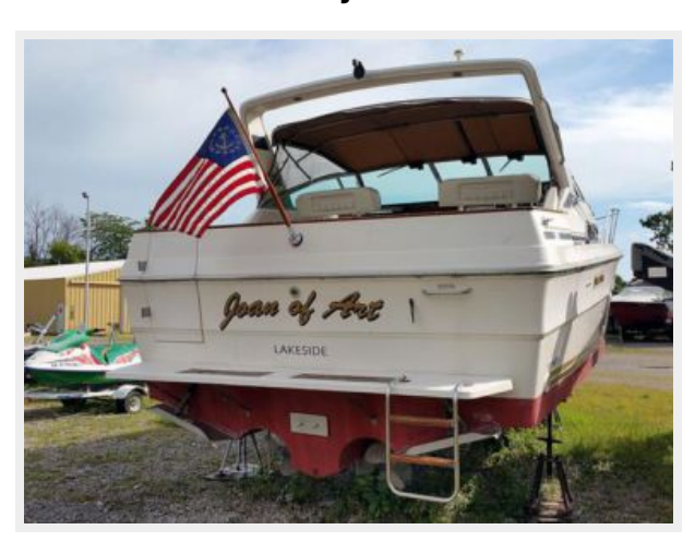
34' Sea Ray Aft Profile