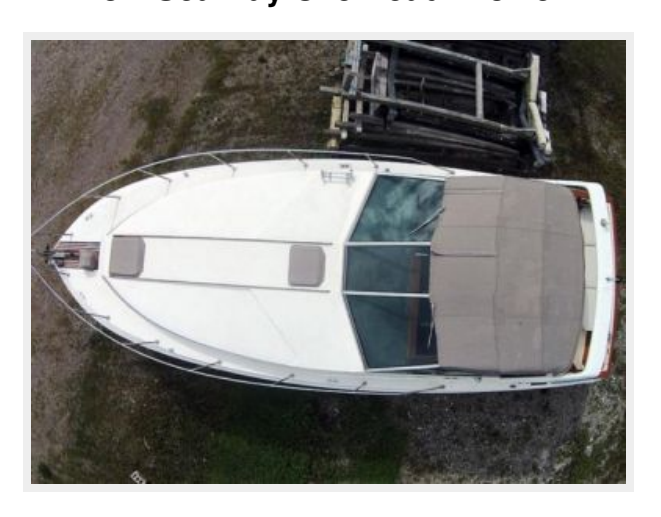
34' Sea Ray Overhead Profile