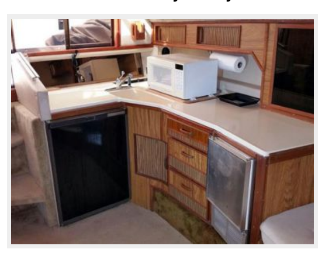
34' Sea Ray Galley