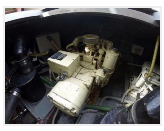
34' Sea Ray Generator