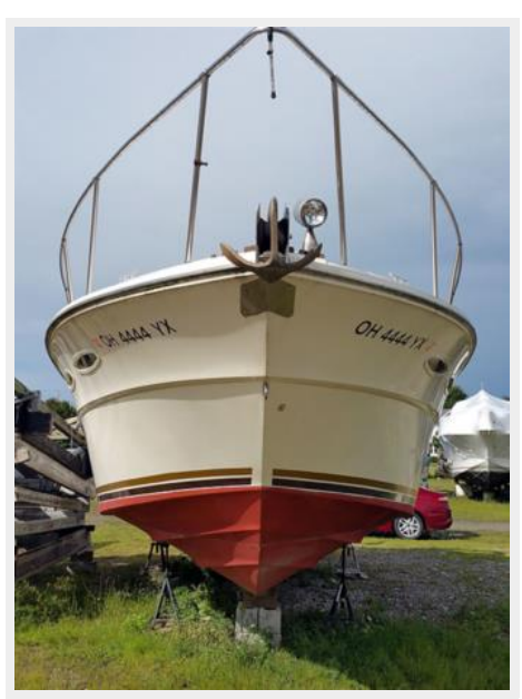
34' Sea Ray Forward Profile