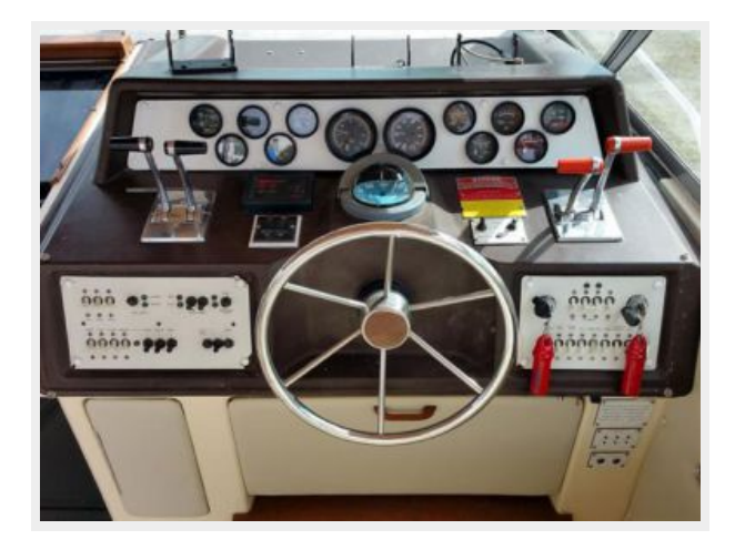
34' Sea Ray Helm Photo1