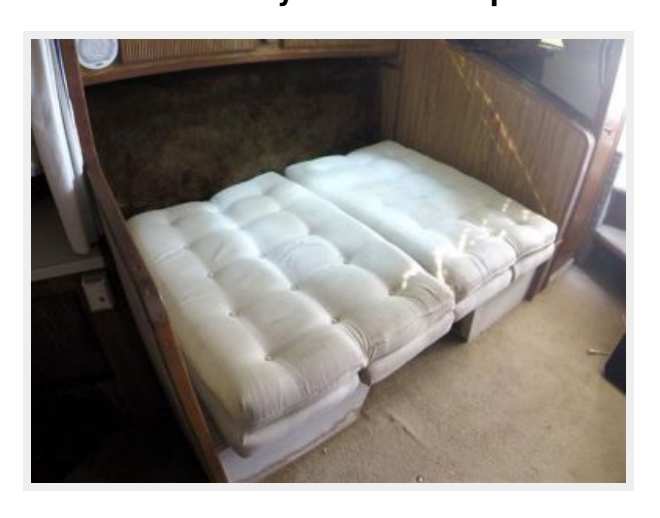
34' Sea Ray Dinette Sleeper