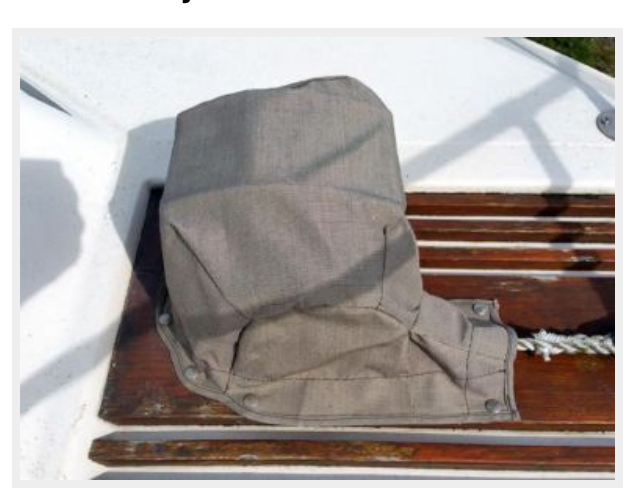
34' Sea Ray Anchor Windlass Covered