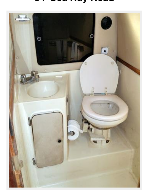
34' Sea Ray Head