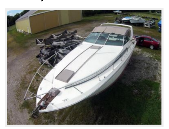
34' Sea Ray Port Forward Overhead Profile