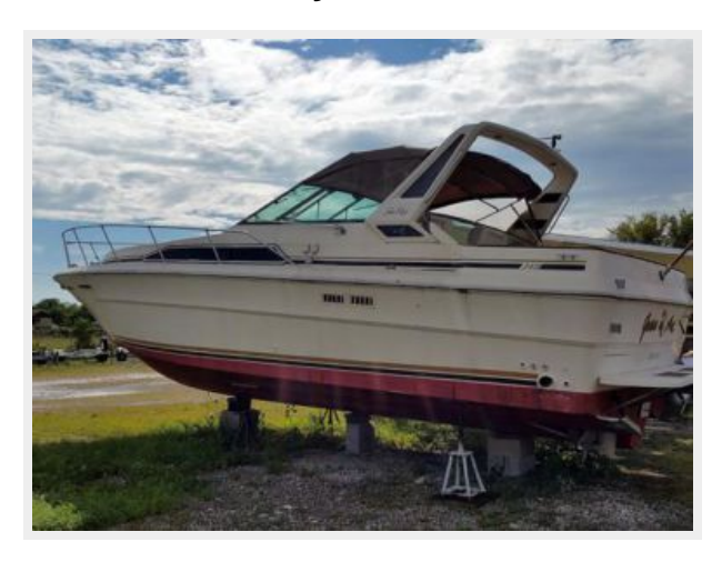
34' Sea Ray Port Aft Profile