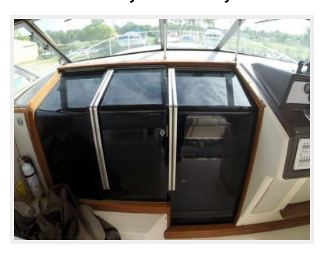
34' Sea Ray Salon Entry Door