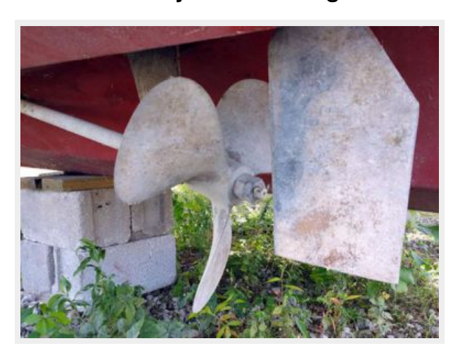
34' Sea Ray Port Running Gear