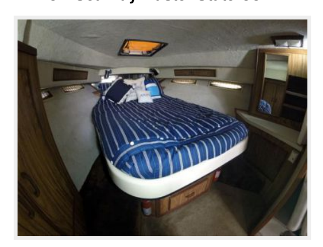
34' Sea Ray Master Stateroom