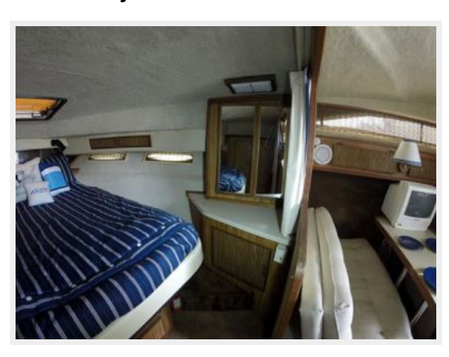
34' Sea Ray Master Stateroom Starboard