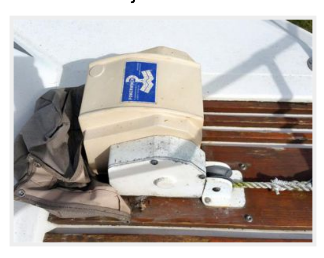
34' Sea Ray Anchor Windlass