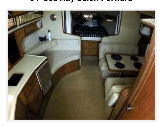
34' Sea Ray Salon Forward