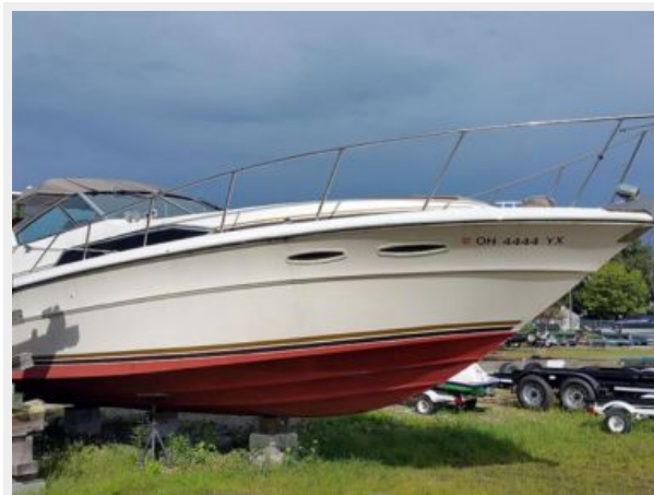
34' Sea Ray Starboard Forward Profile