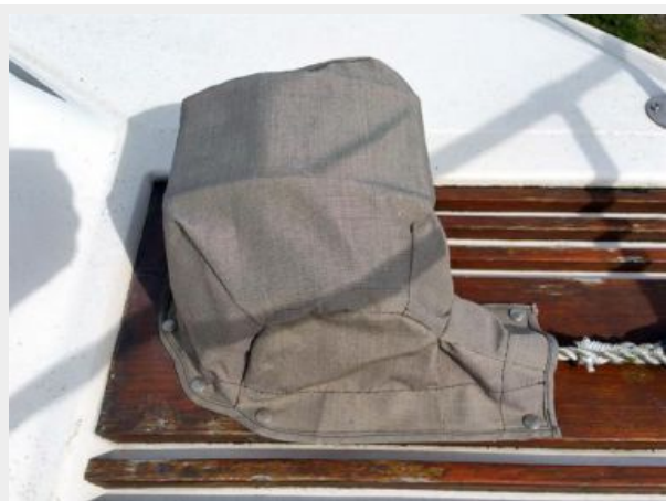
34' Sea Ray Anchor Windlass Covered