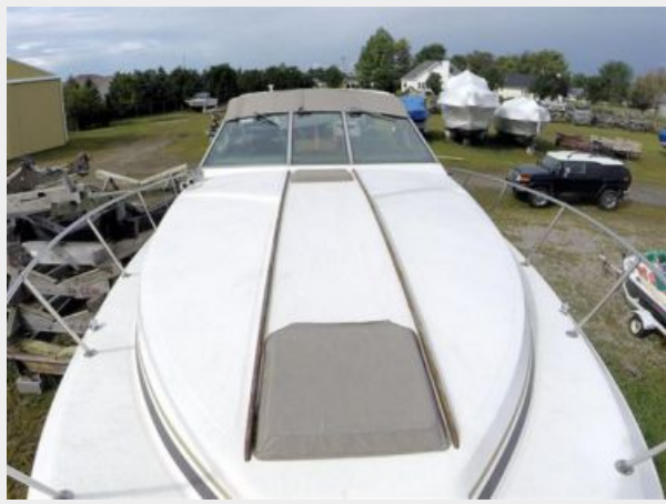
34' Sea Ray Foredeck Aft