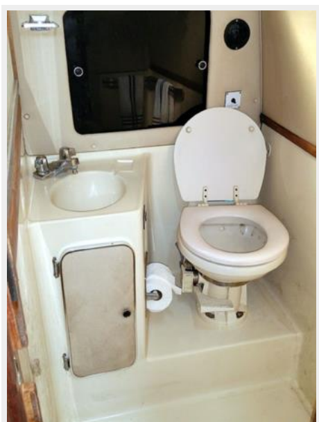
34' Sea Ray Head