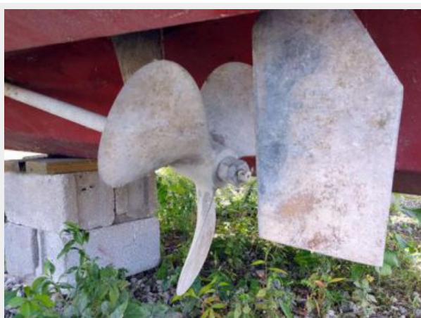
34' Sea Ray Port Running Gear