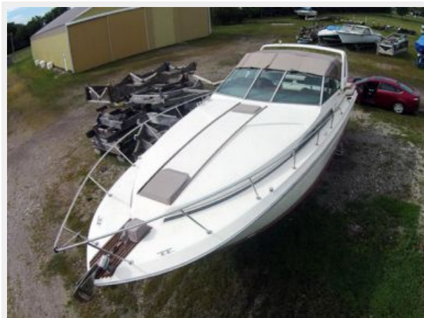
34' Sea Ray Port Forward Overhead Profile