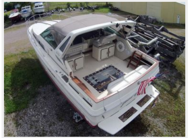
34' Sea Ray Cockpit