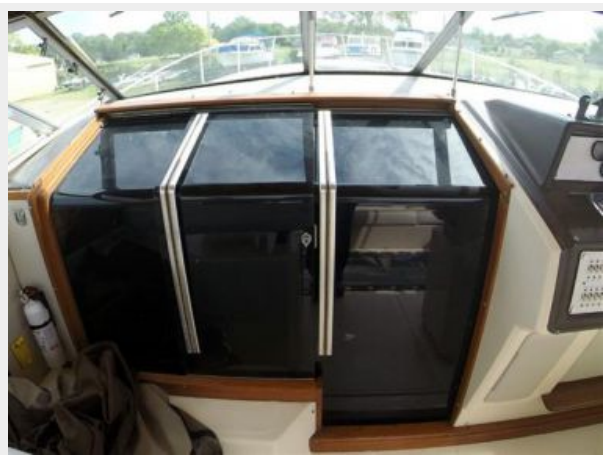
34' Sea Ray Salon Entry Door