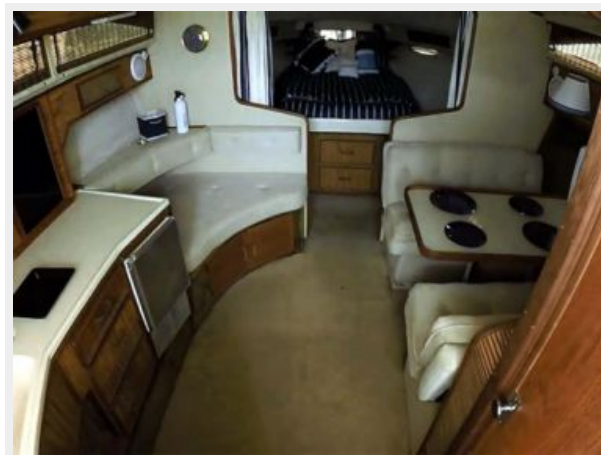
34' Sea Ray Salon Port Forward