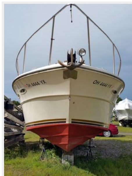
34' Sea Ray Forward Profile