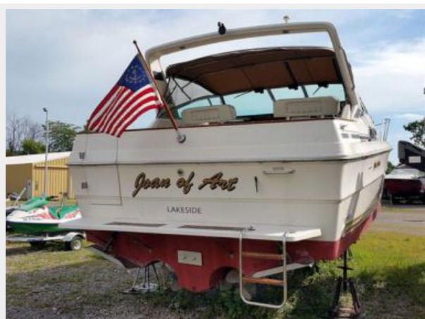
34' Sea Ray Aft Profile