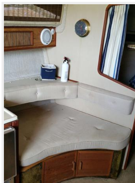
34' Sea Ray Salon Port Forward