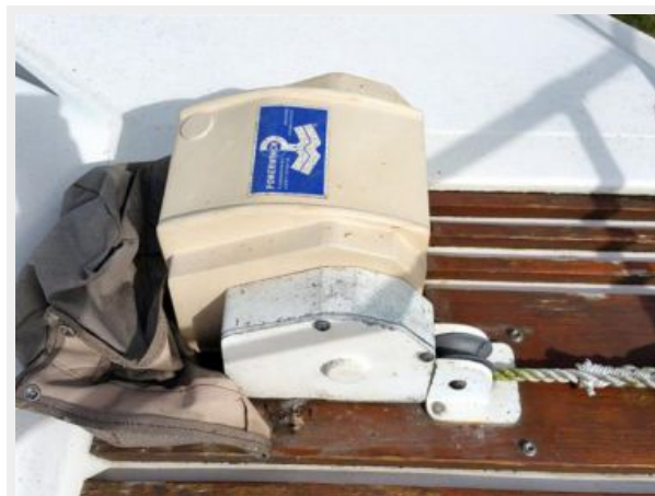
34' Sea Ray Anchor Windlass