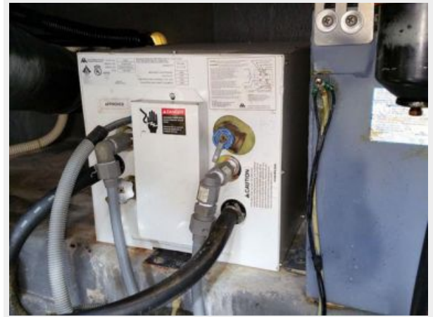
34' Sea Ray Water Heater