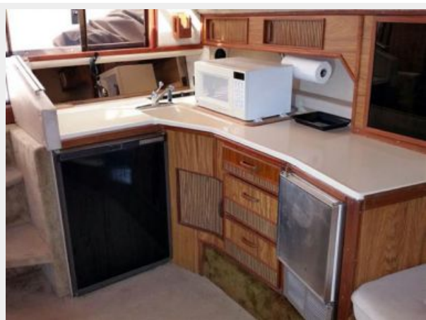
34' Sea Ray Galley