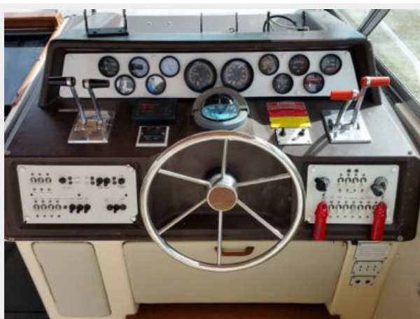
34' Sea Ray Helm Photo1