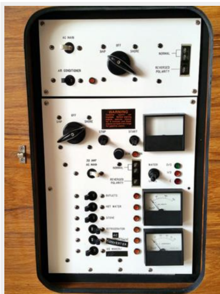
34' Sea Ray Electrical Panel