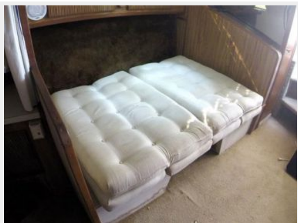
34' Sea Ray Dinette Sleeper