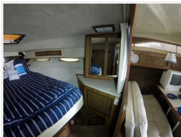
34' Sea Ray Master Stateroom Starboard