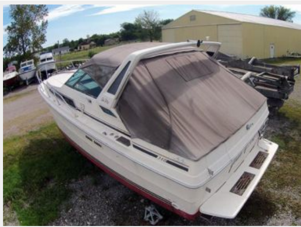
34' Sea Ray Cockpit Covered