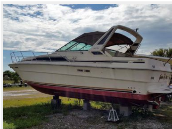
34' Sea Ray Port Aft Profile