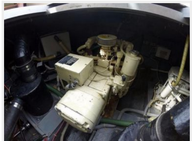
34' Sea Ray Generator