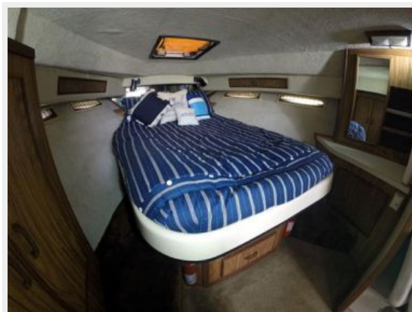
34' Sea Ray Master Stateroom