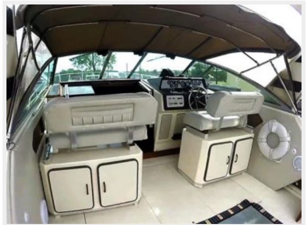
34' Sea Ray Cockpit