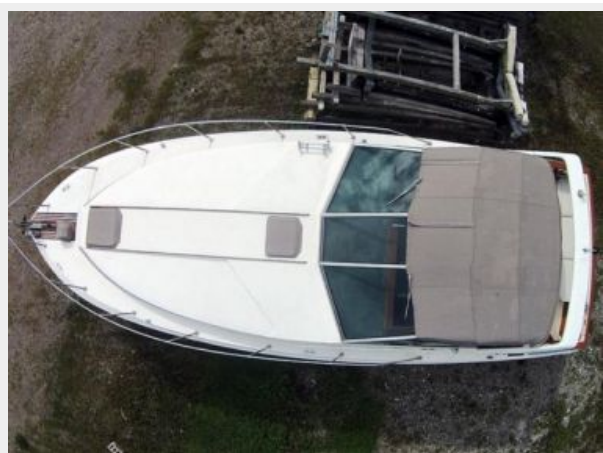
34' Sea Ray Overhead Profile