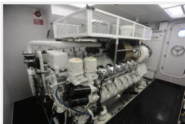
Starboard Engine with Custom Storage Rack Above