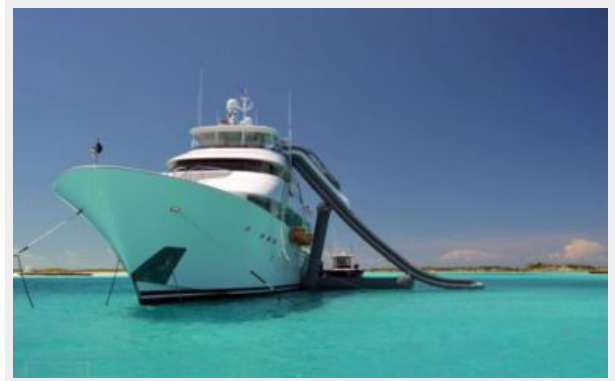
Custom Teak Slide Box (Cost $7,000 New)