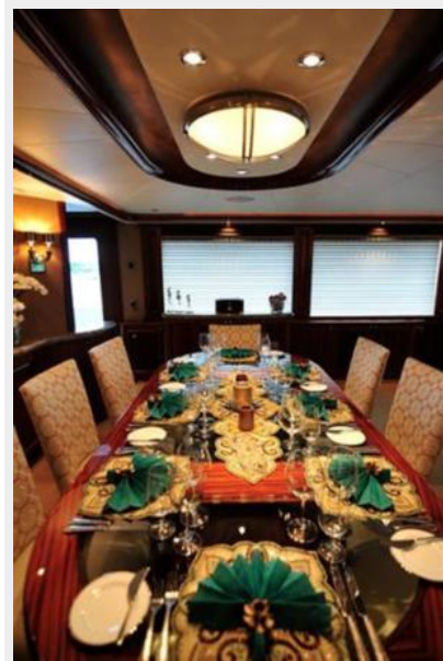
Formal Dining Area