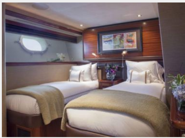
Twin Stateroom with Pullman Stowed