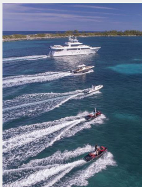
Amitie with Toys and Tender