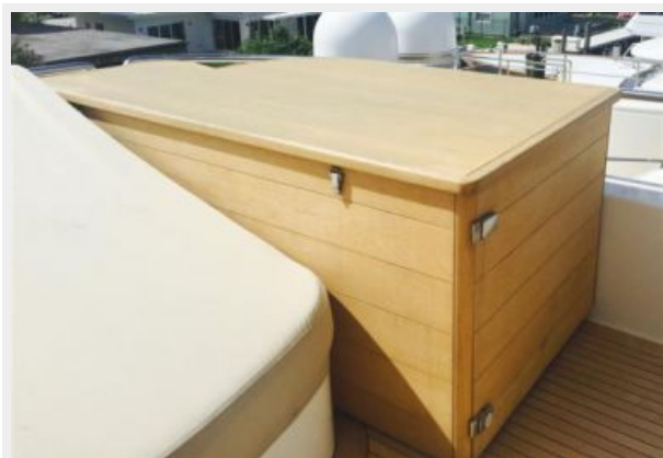
Custom Teak Slide Box (Cost $7,000 New)