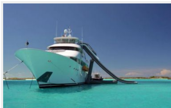
Custom Teak Slide Box (Cost $7,000 New)