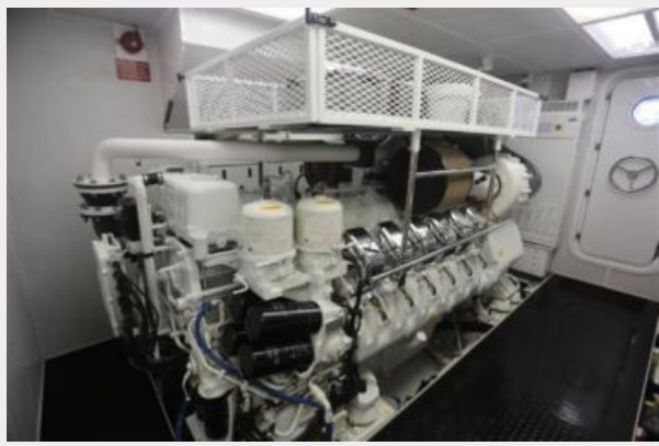
Starboard Engine with Custom Storage Rack Above