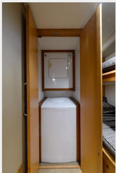
Washer and Dryer