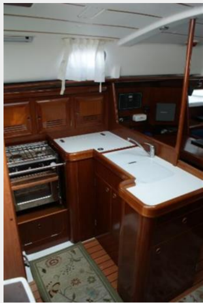
2004 Beneteau 361 Galley