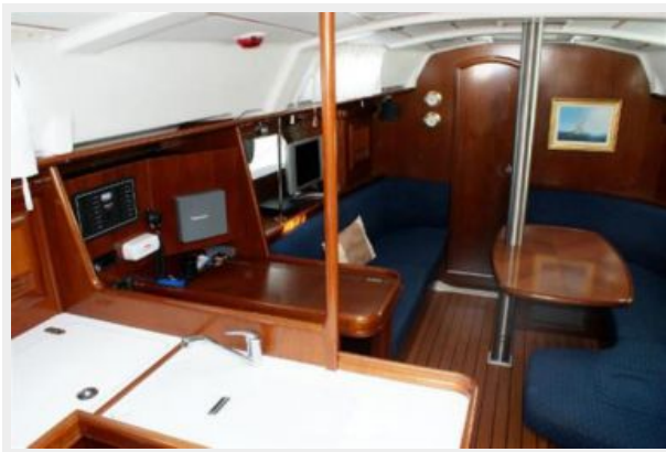
2004 Beneteau 361 Salon