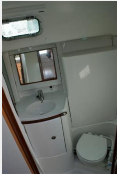
2004 Beneteau 361 Head