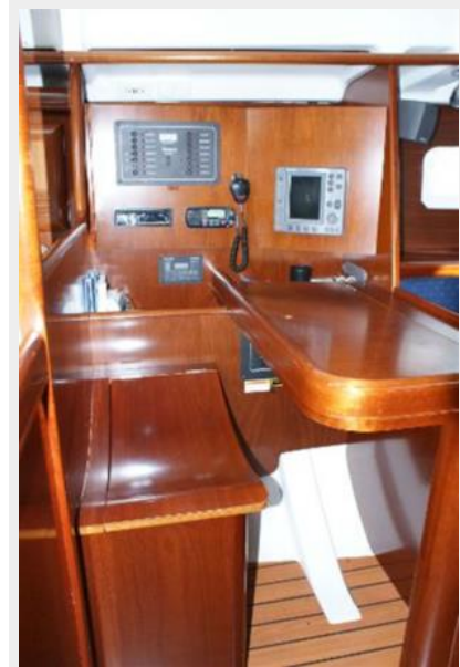
2004 Beneteau 361 Aft Cabin