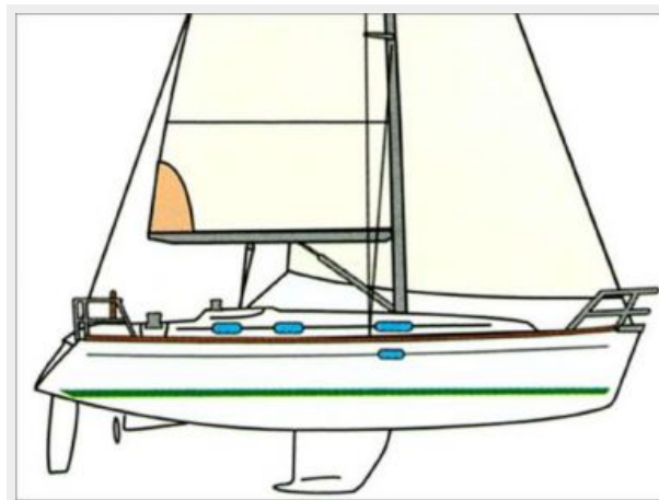
Beneteau 361 Sail plan