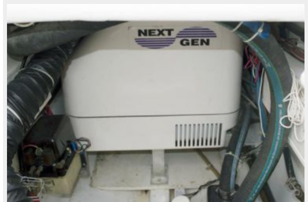
Next Gen Genset