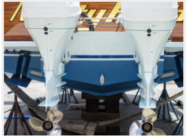
Stern View Hauled Out