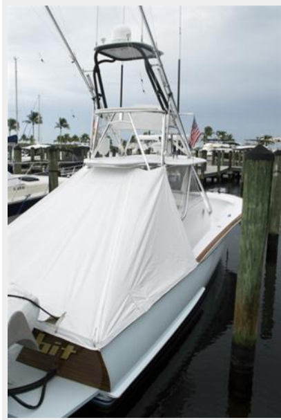
Starboard Stern View