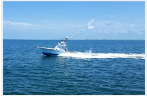
Starboard Profile 2