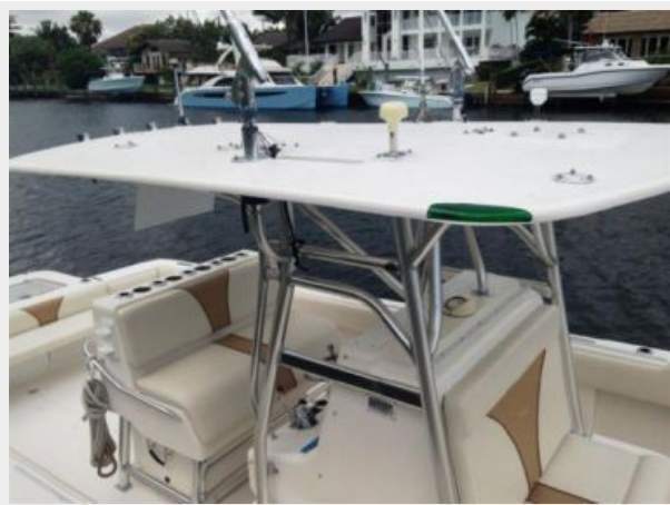
Hard Top & Outriggers, (new radar not pictured)