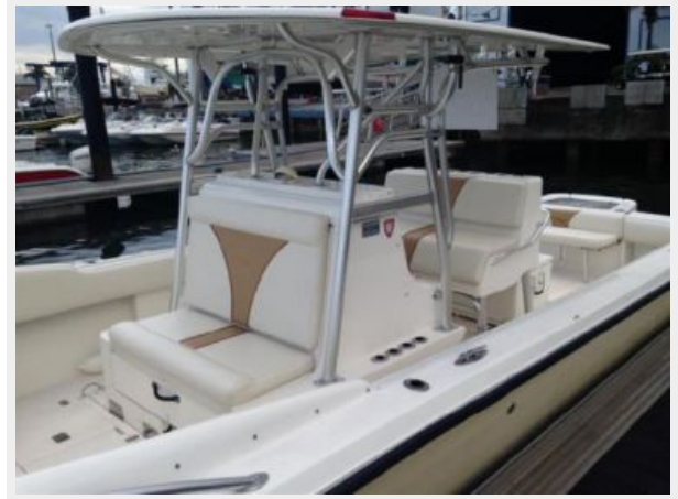
Hard Top, New Seats & Bolsters