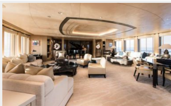
RoMEA - Upper deck salon