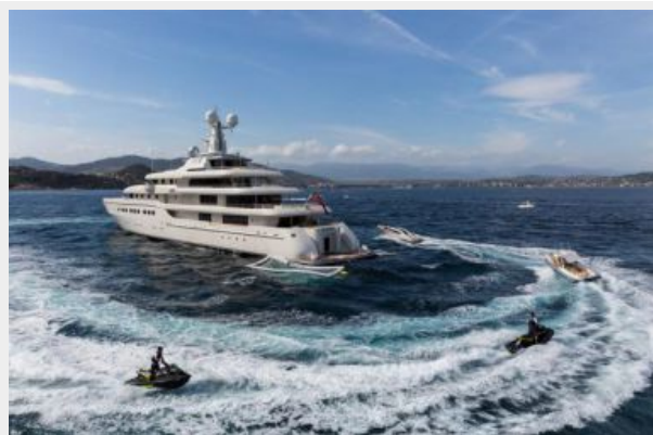
RoMEA - Water sports