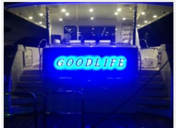
Transom night BLUE