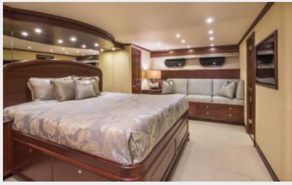
Guest stateroom starboard