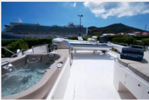
Deck with Jacuzzi and tender