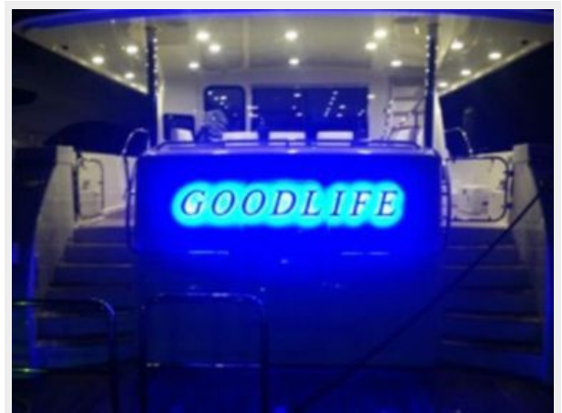
Transom night BLUE