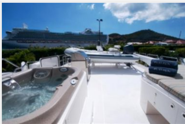
Deck with Jacuzzi and tender