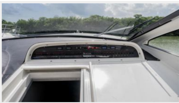
Electronic Panel/Salon Entrance