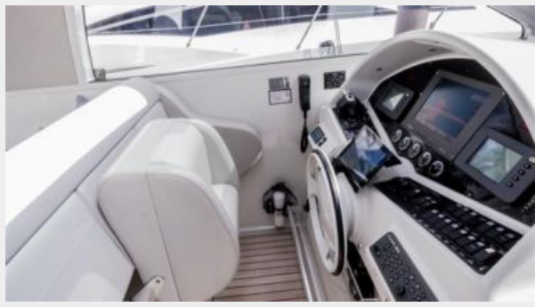
Port Companion Seating