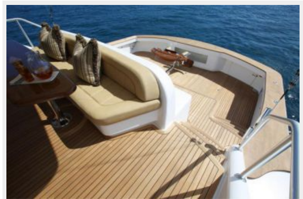
Upper Mezzanine and Deck Below