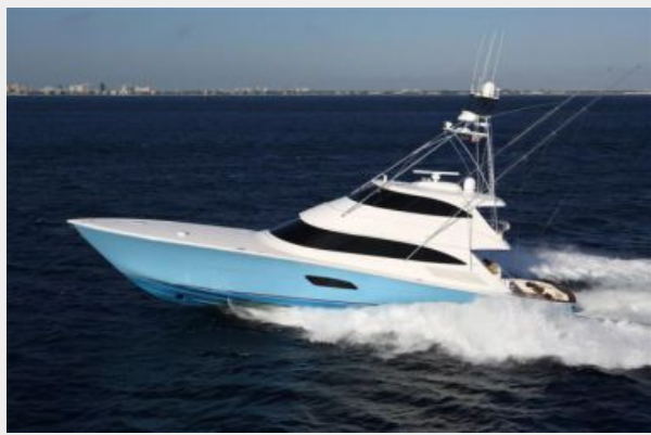
Scooter 92 Viking 2015