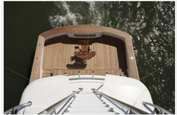
Scooter 92 Viking 2015