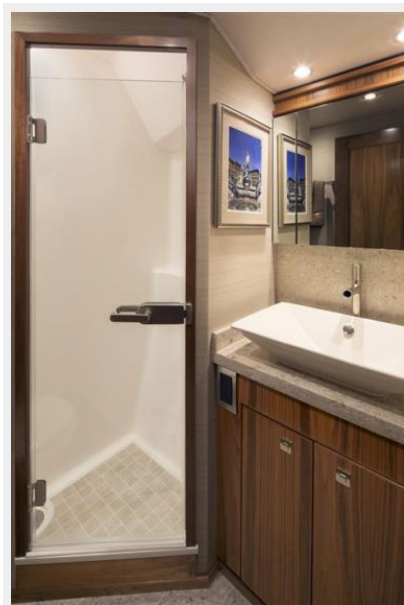
Aft Stateroom Head