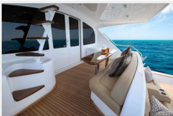
Upper and Lower Mezzanine