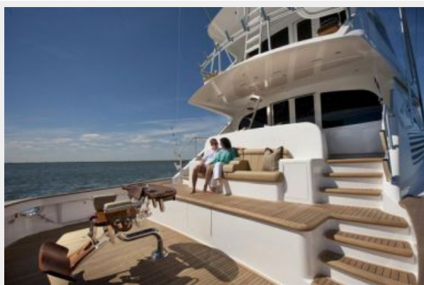
Lower Mezzanine and Deck Area