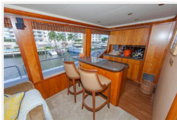
Upper Deck Bar