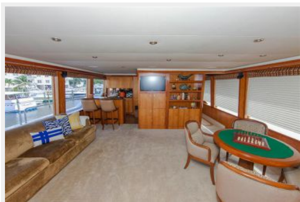
Upper Deck Lounge