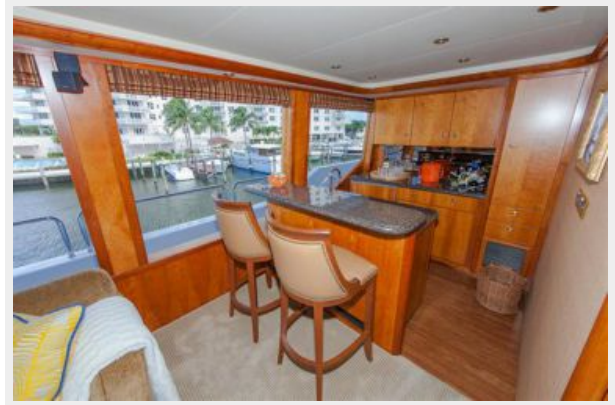
Upper Deck Bar