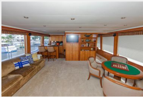
Upper Deck Bar