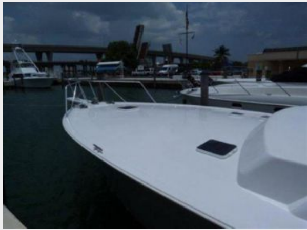
Custom bow rail