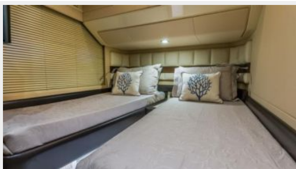
Twin Guest Stateroom