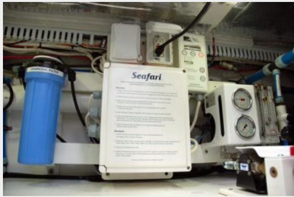
Seafari Water Maker