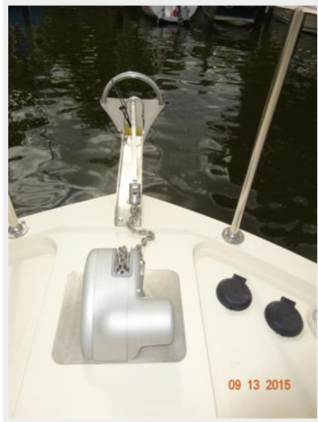
31' Camano anchor windlass