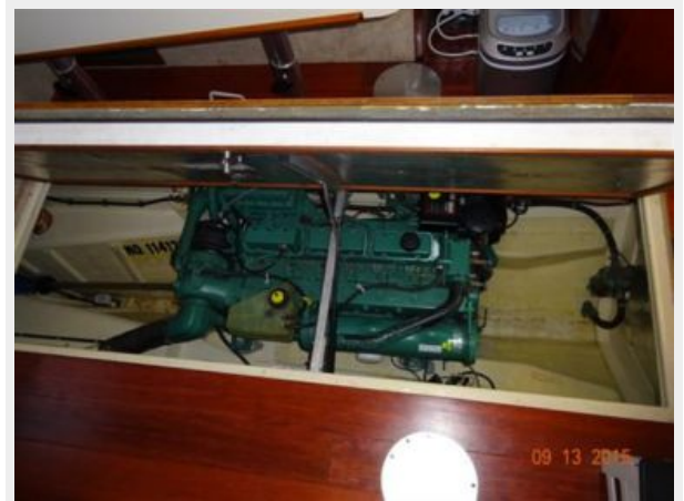
31' Camano engine compartment access