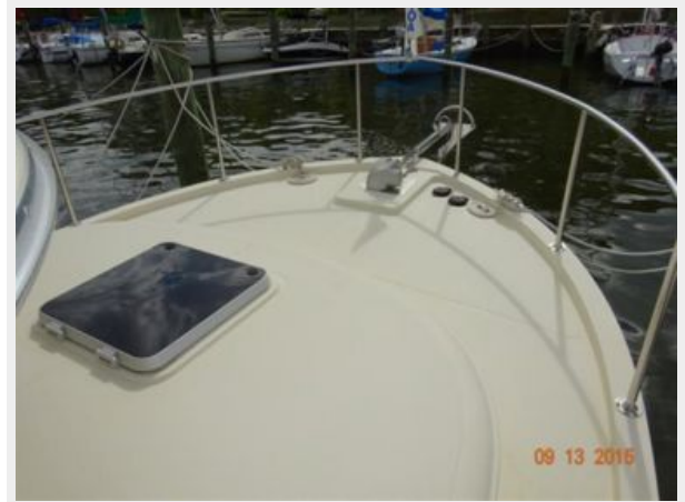
31' Camano foredeck