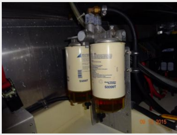
31' Camano Racor fuel filters