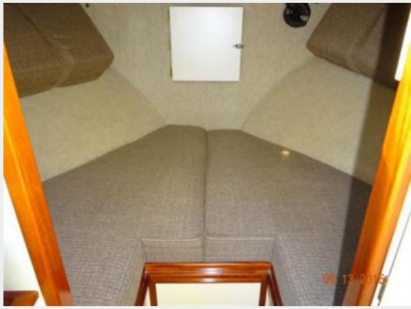
31' Camano stateroom photo1