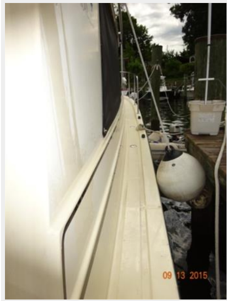
31' Camano starboard side deck