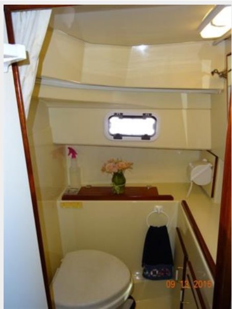
31' Camano head