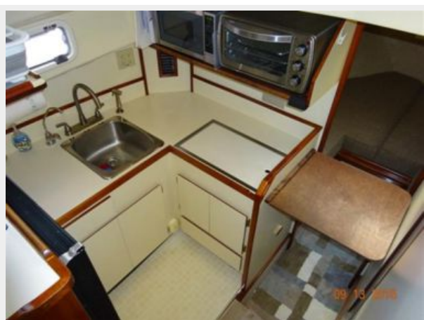
31' Camano galley photo2