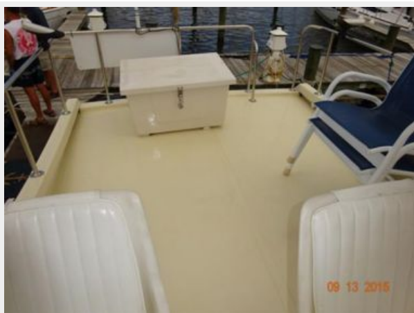
31' Camano flybridge aft