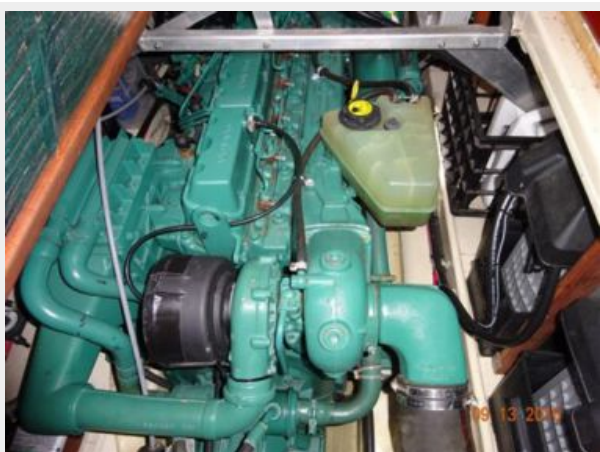
31' Camano main engine