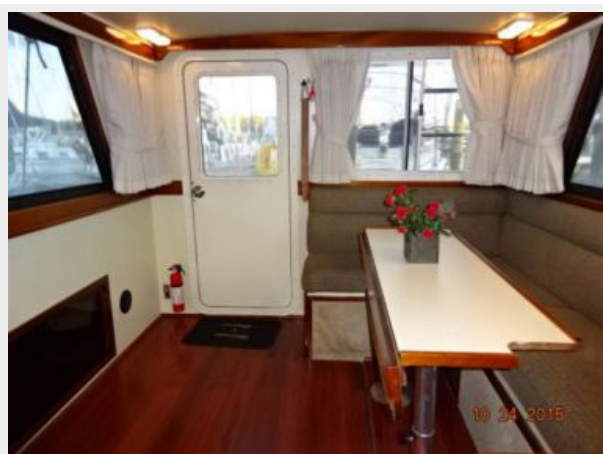
31' Camano salon aft