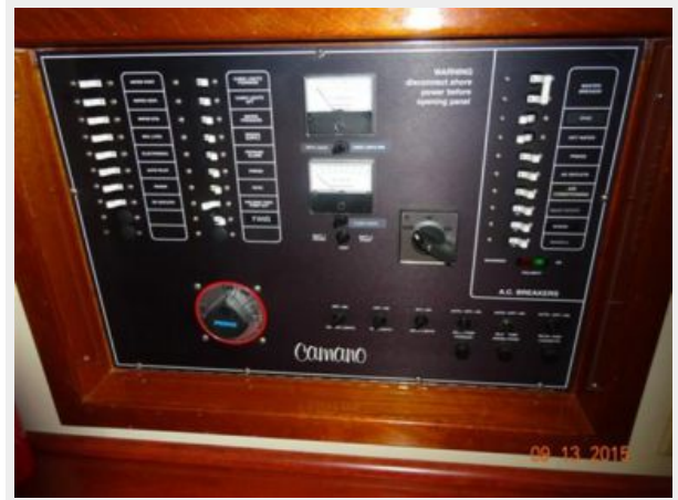
31' Camano electrical panel