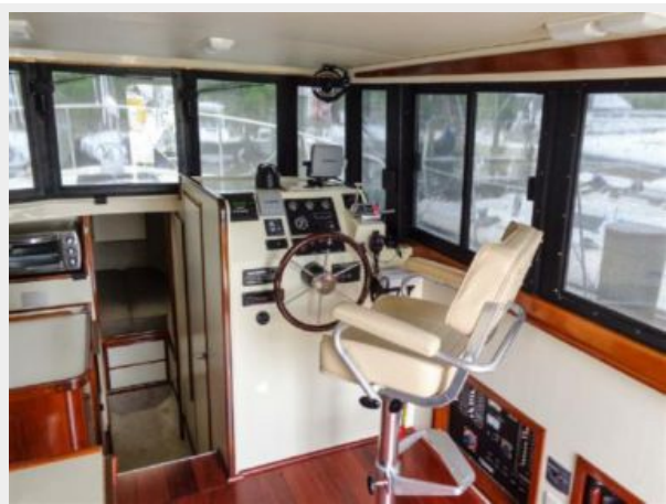
31' Camano lower helm