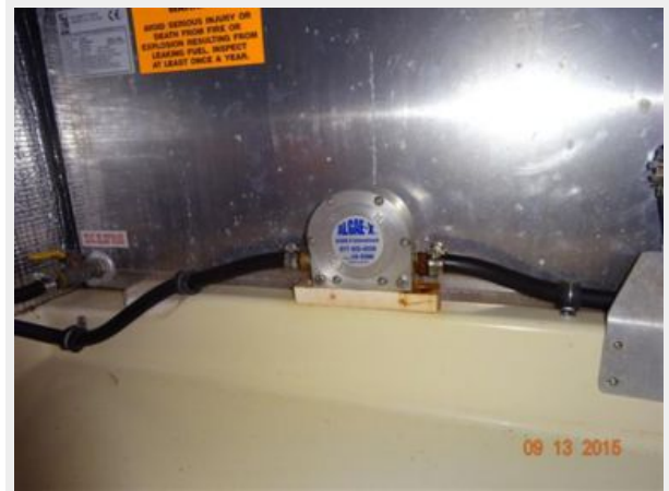
31' Camano Algae-X fuel conditioning system