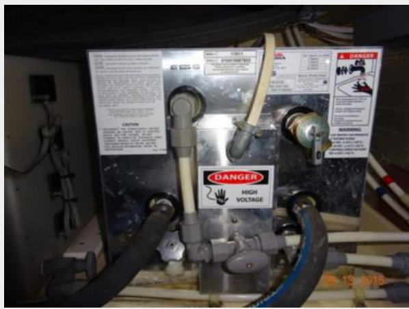
31' Camano water heater