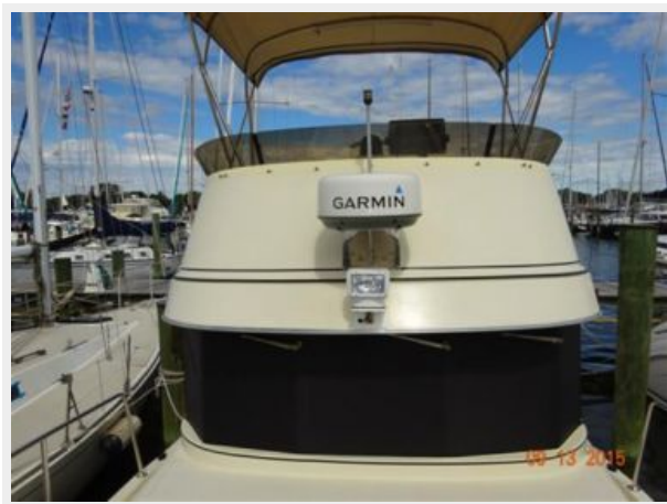
31' Camano foredeck aft