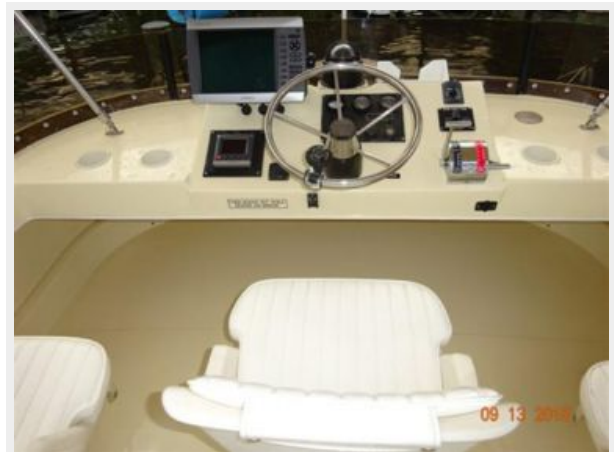
31' Camano flybridge helm