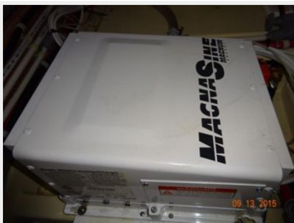
31' Camano inverter/charger