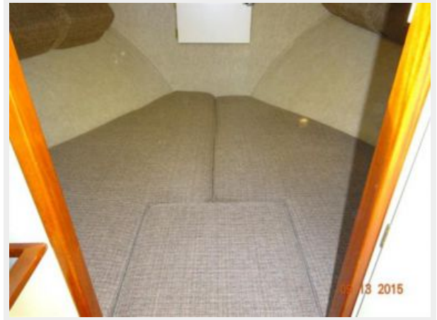
31' Camano stateroom photo2