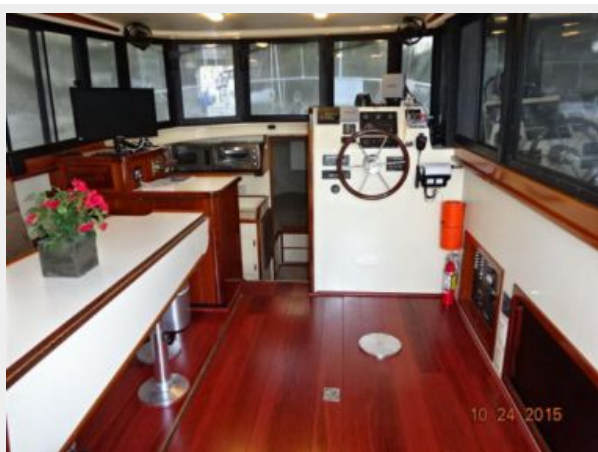
31' Camano salon forward photo1