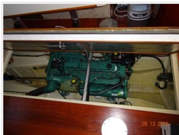
31' Camano engine compartment access