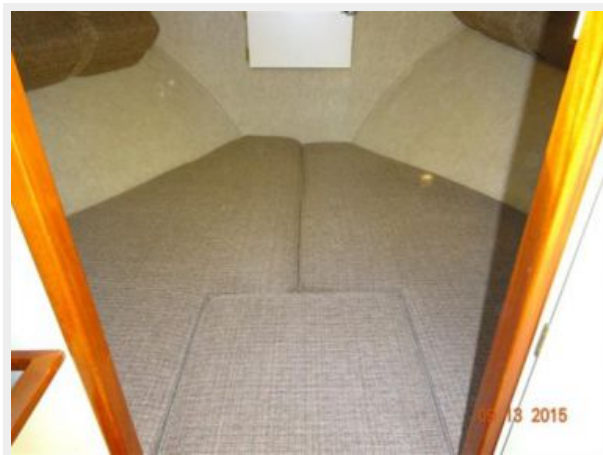
31' Camano stateroom photo2