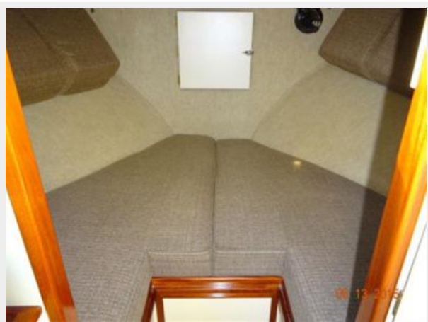
31' Camano stateroom photo1