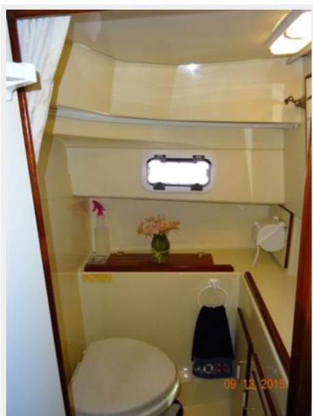
31' Camano head