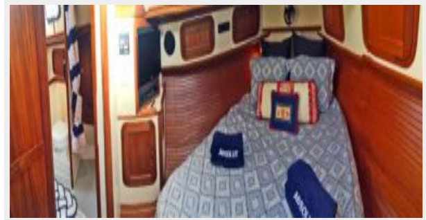
Cabin with En-suite Head