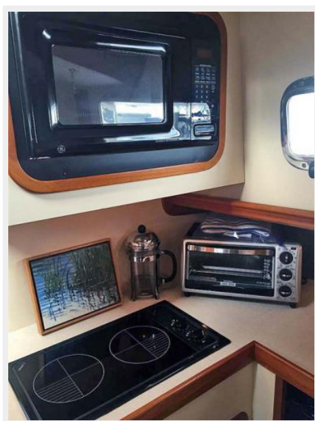
Range and Microwave