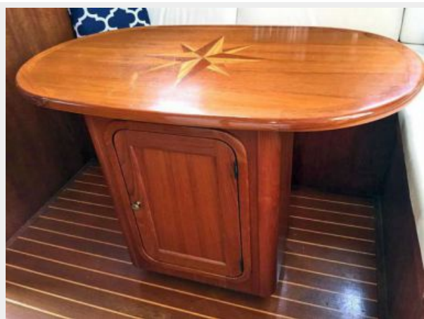
Teak Table with Storage