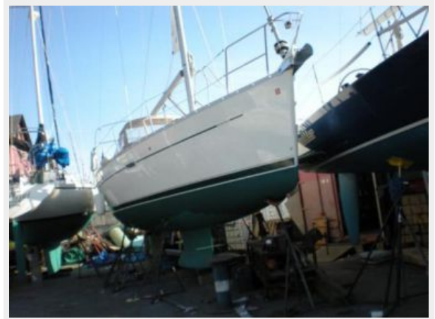
Starbord hull/ on the Hard