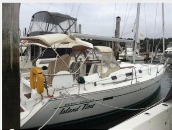
Starboard Hull at the Slip