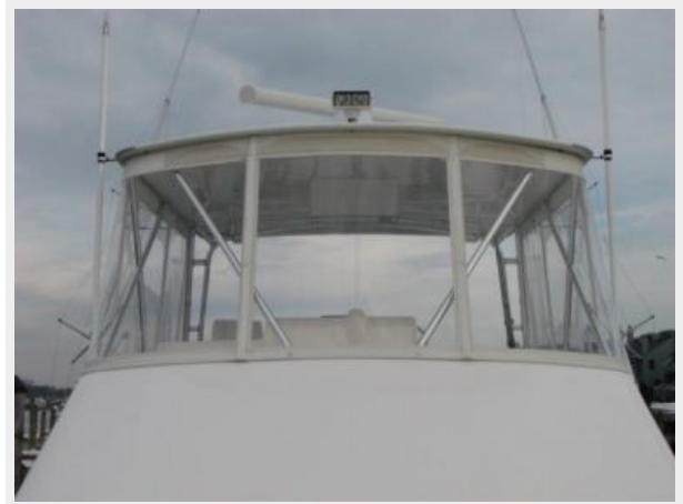
Deck 3 - Bridge