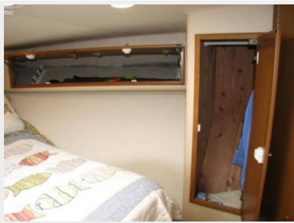
Master Stateroom 2