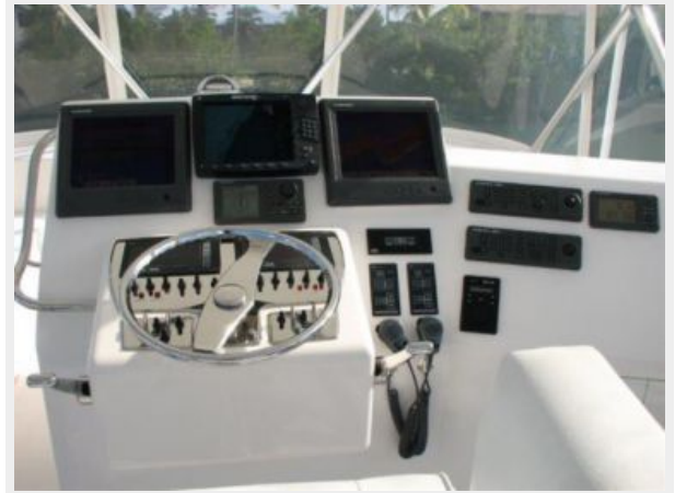
Helm / Electronics & Navigation 1