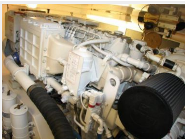
Engine & Mechanical Equipment 3 - Starboard Engine