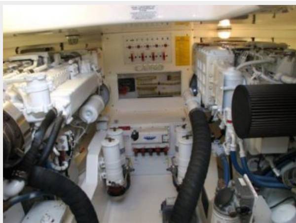
Engine & Mechanical Equipment 1 - Engine Room