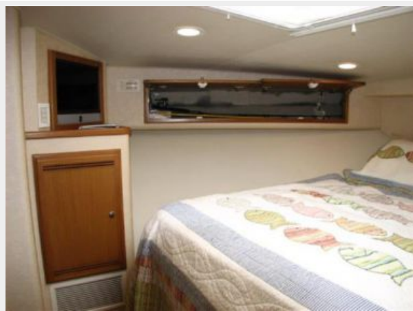
Master Stateroom 4