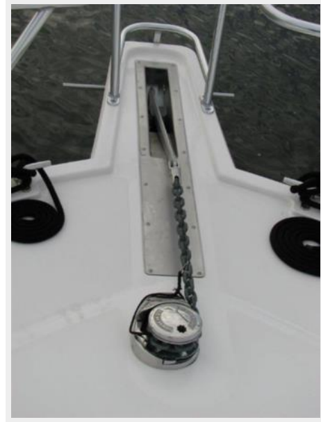
Deck 1 - Bow Pulpit