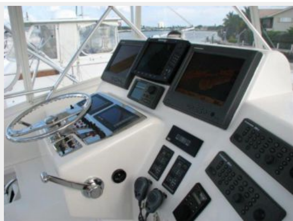
Helm / Electronics & Navigation 4