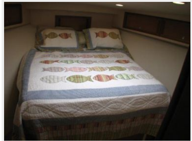
Master Stateroom 1