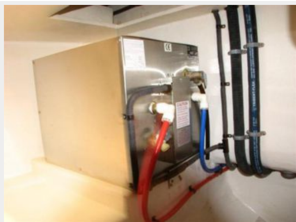
Engine & Mechanical Equipment 7 - Hot Water Heater