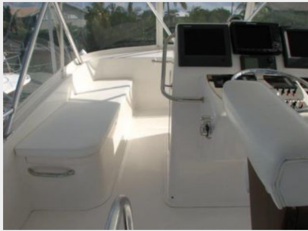
Deck 6 - Port Bridge Seating