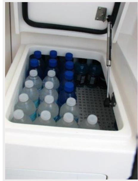
Cockpit / Fishing Equipment 4 - Refrigerated Drink Box