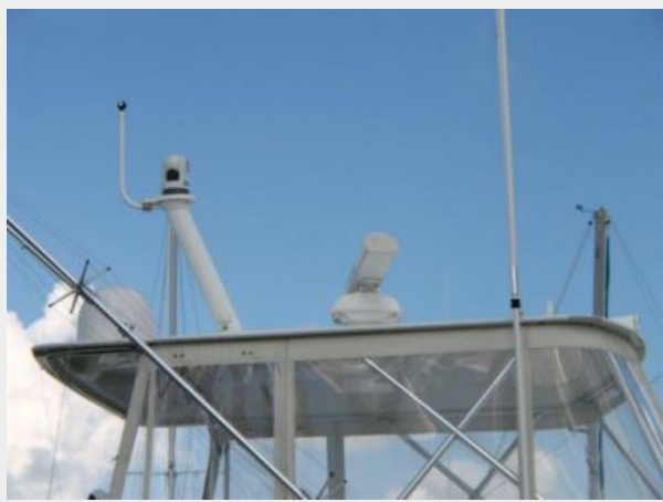
Deck 2 - Hardtop