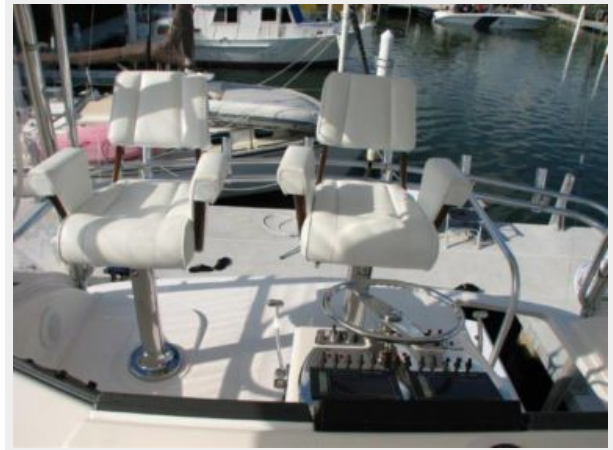
Deck 7 - Helm Chairs