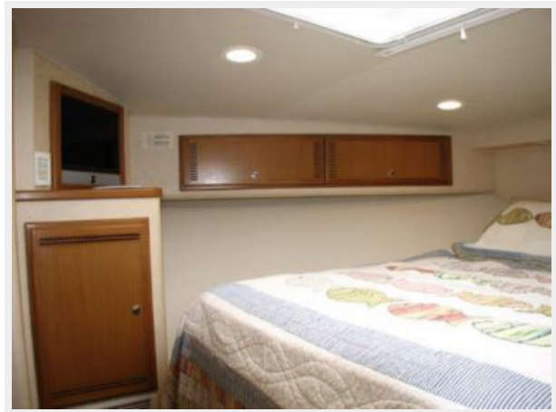
Master Stateroom 3