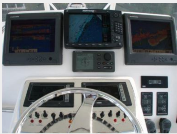
Helm / Electronics & Navigation 2