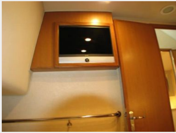
Guest Stateroom 2 - TV