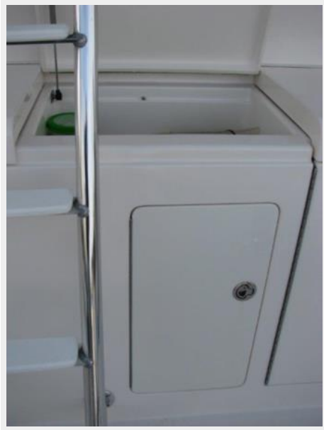
Cockpit / Fishing Equipment 3 - Tackle Locker & Storage