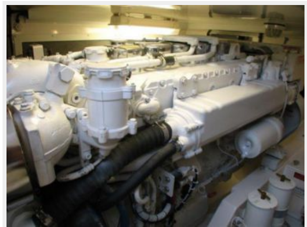
Engine & Mechanical Equipment 2 - Port Engine