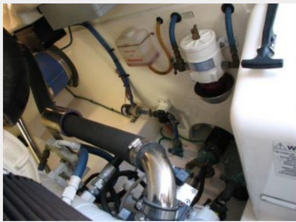
Engine & Mechanical Equipment 5 - Engine Room