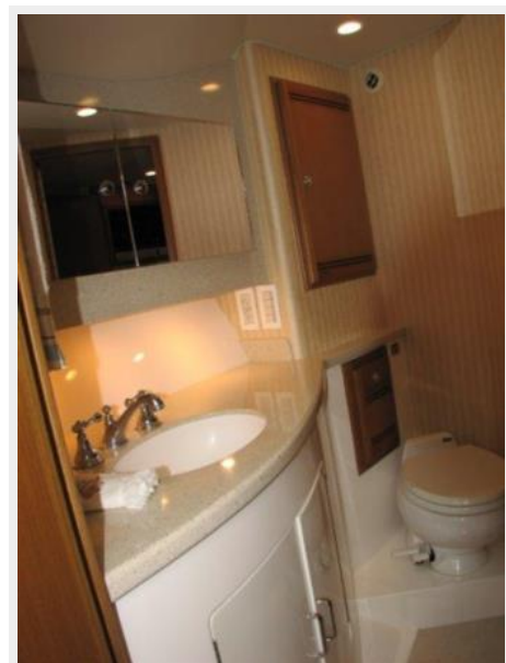
Master Head 2