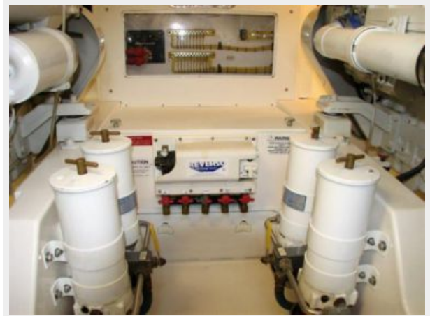
Engine & Mechanical Equipment 6 - Engine Room