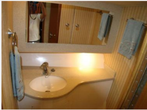
Guest Head 1