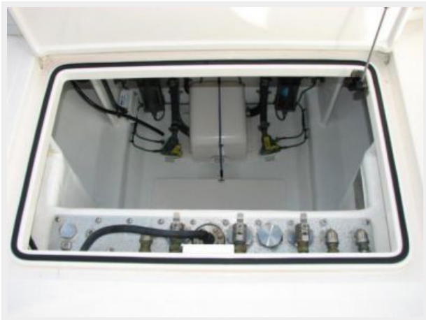
Cockpit / Fishing Equipment 5 - Lazarette