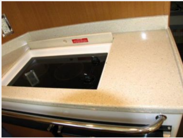
Galley 5 - Cook Top