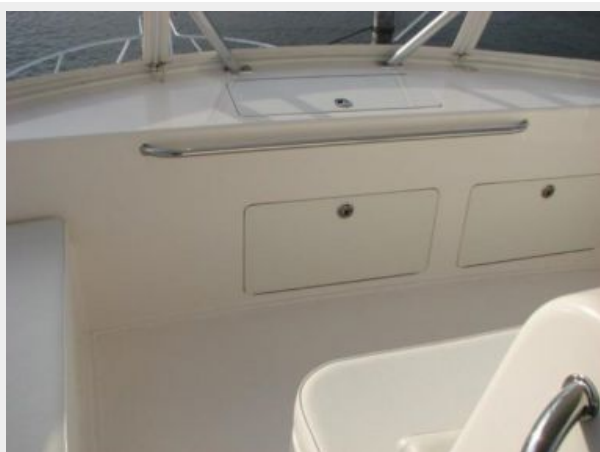
Deck 4 - Forward Bridge