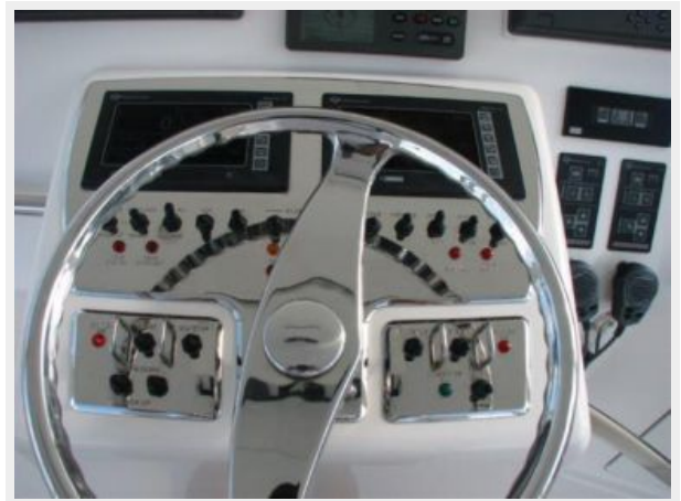
Helm / Electronics & Navigation 3