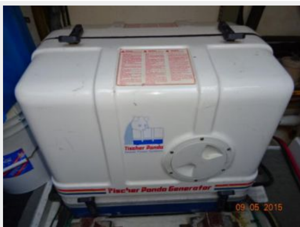
54' Ocean Alexander generator2 sound box