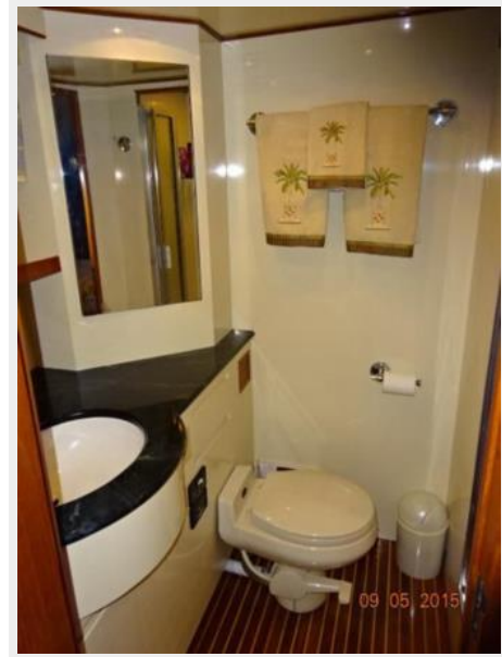
54' Ocean Alexander master stateroom head