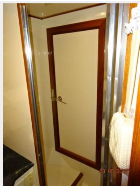
54' Ocean Alexander port guest stateroom shower