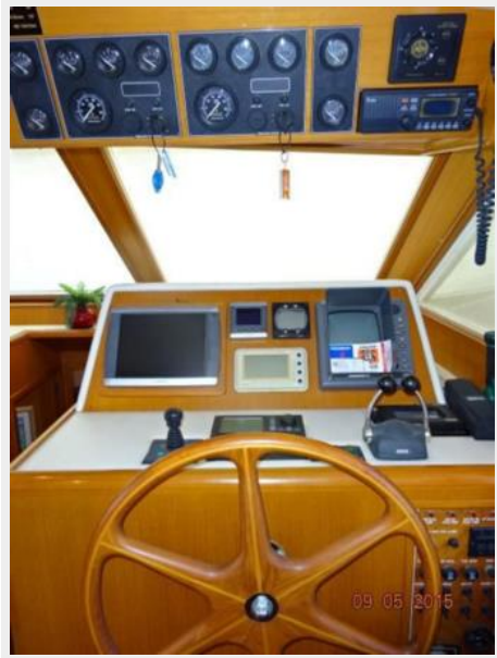
54' Ocean Alexander lower helm photo2