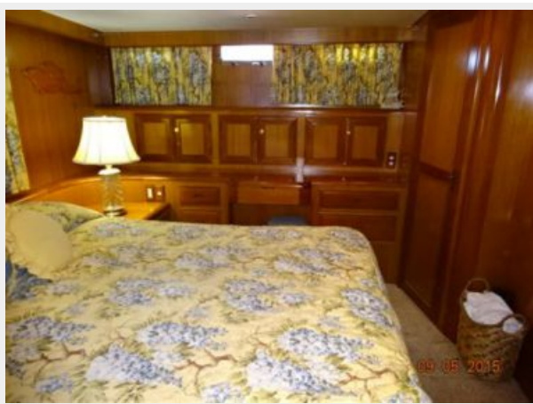
54' Ocean Alexander master stateroom port