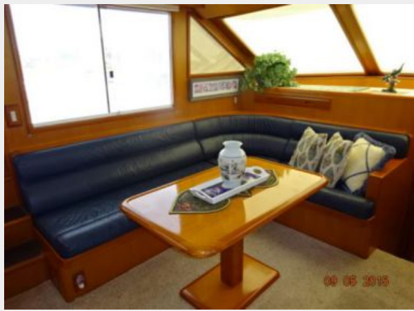
54' Ocean Alexander salon port seating