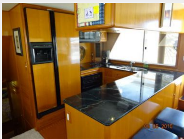
54' Ocean Alexander galley photo1