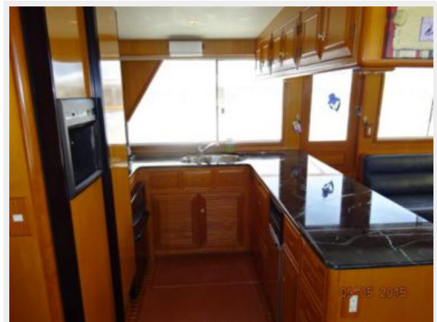
54' Ocean Alexander galley photo2