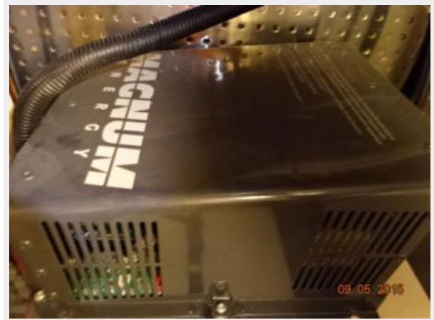
54' Ocean Alexander inverter