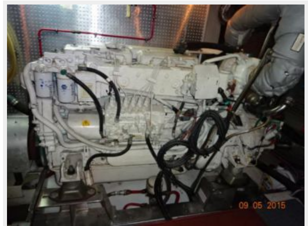
54' Ocean Alexander starboard main engine