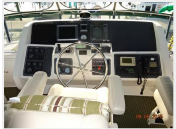
54' Ocean Alexander flybridge helm photo1