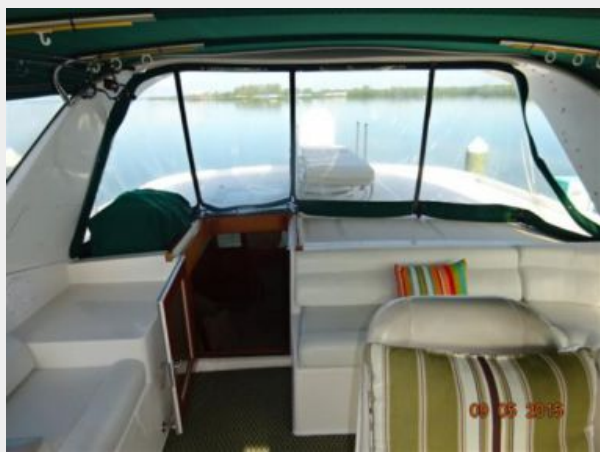
54' Ocean Alexander flybridge aft