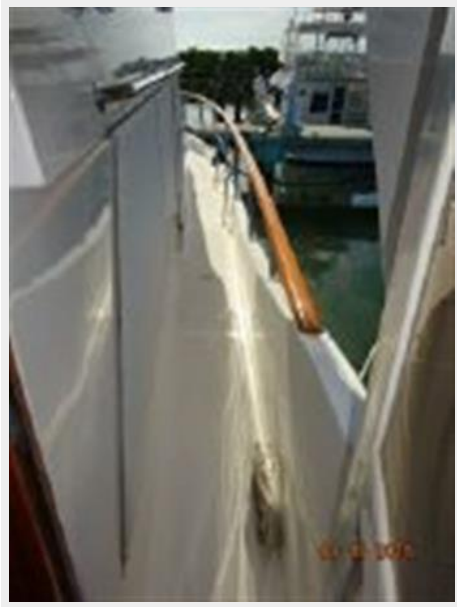
54' Ocean Alexander starboard side deck photo2