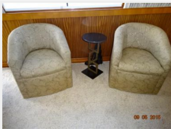
54' Ocean Alexander sundeck starboard lounge chairs