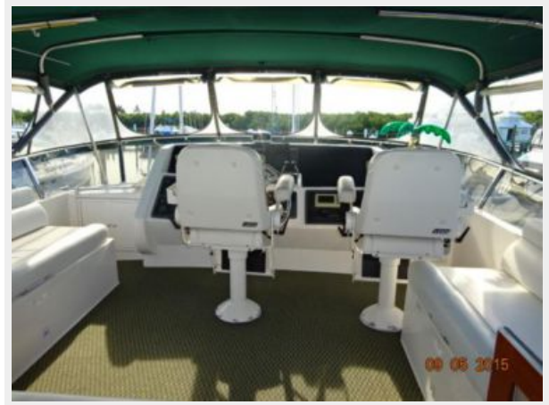
54' Ocean Alexander flybridge forward