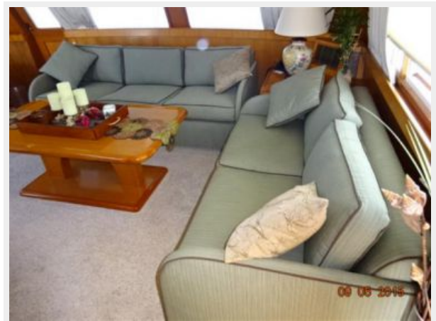
54' Ocean Alexander sundeck port seating photo1