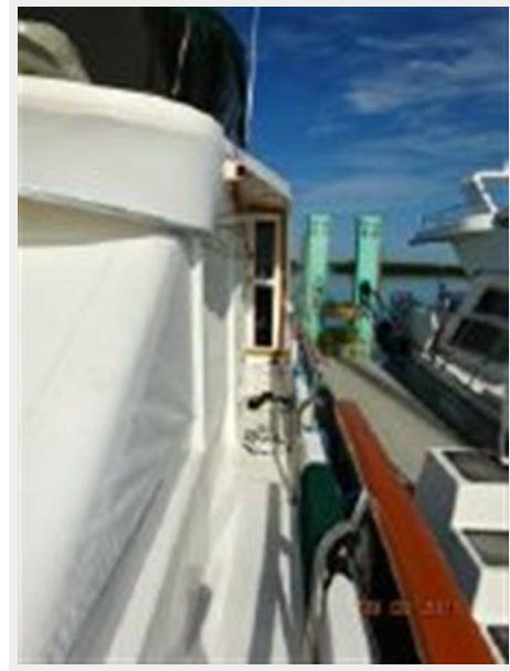
54' Ocean Alexander port side deck photo1