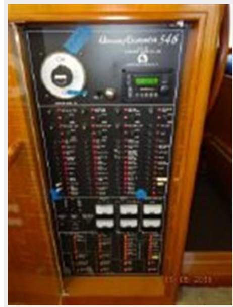
54' Ocean Alexander electrical panel