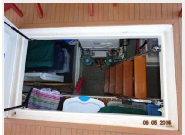
54' Ocean Alexander lazarette access