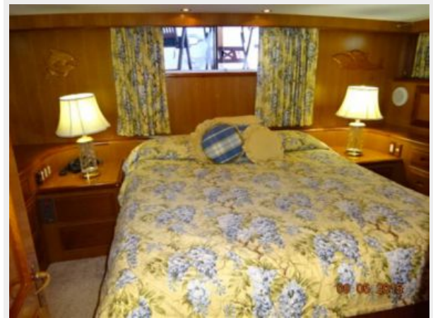
54' Ocean Alexander master stateroom