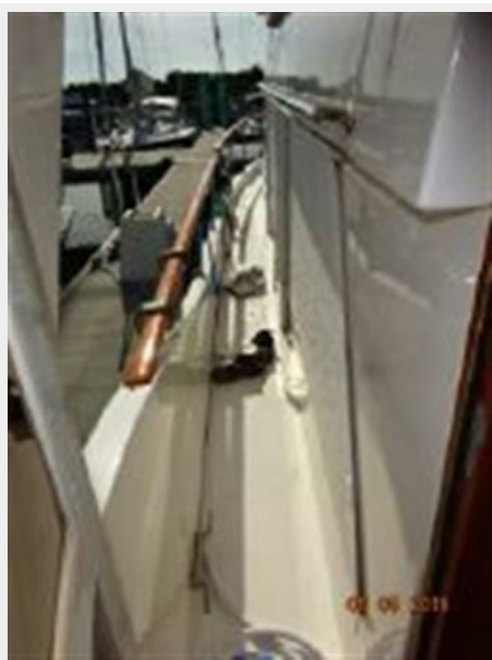
54' Ocean Alexander port side deck photo2