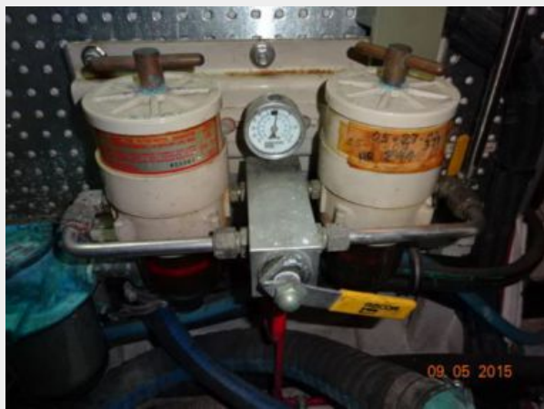
54' Ocean Alexander generator Racor fuel filters