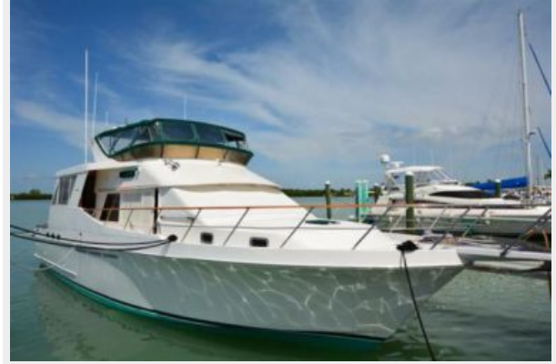
54' Ocean Alexander starboard forward profile