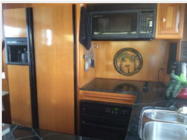
54' Ocean Alexander galley photo3