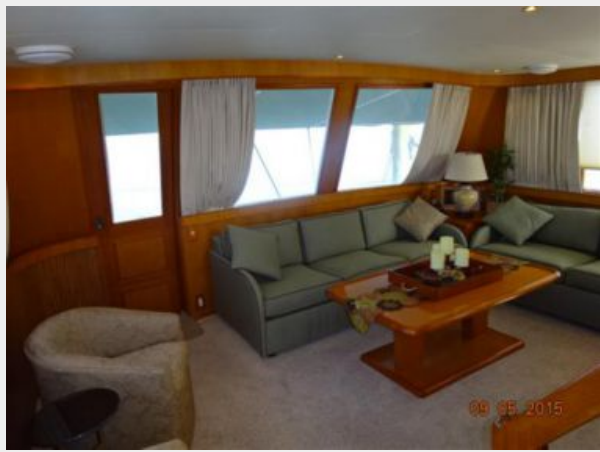
54' Ocean Alexander sundeck1