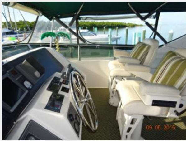
54' Ocean Alexander flybridge starboard