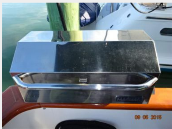
54' Ocean Alexander Magma BBQ grill