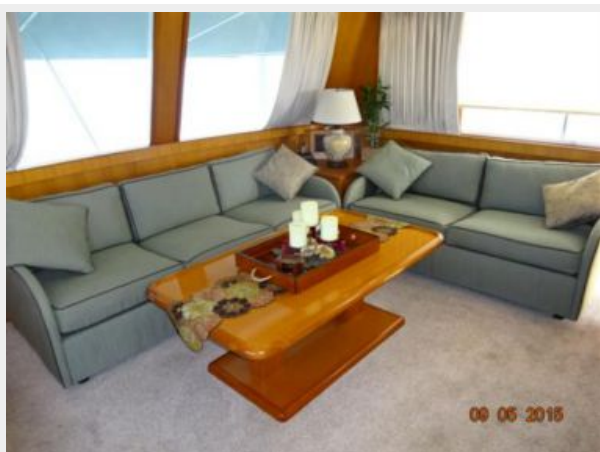
54' Ocean Alexander sundeck port seating photo2