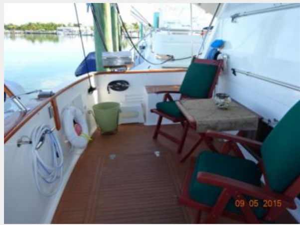
54' Ocean Alexander cockpit port