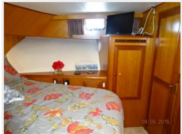
54' Ocean Alexander forward guest stateroom starboard