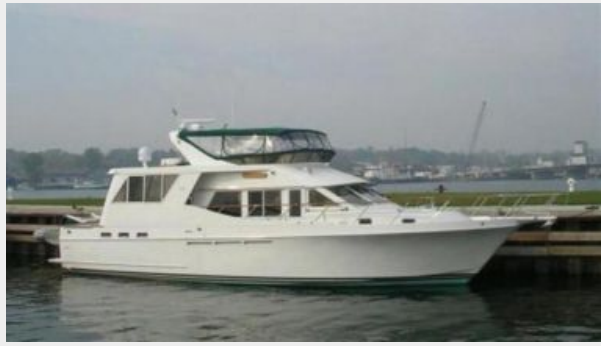
54' Ocean Alexander starboard profile