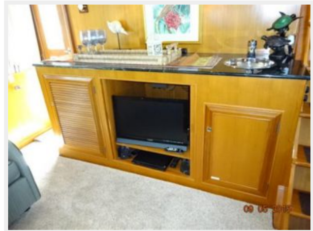
54' Ocean Alexander sundeck wetbar