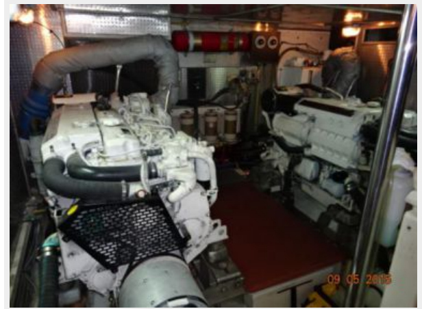
54' Ocean Alexander engine room aft