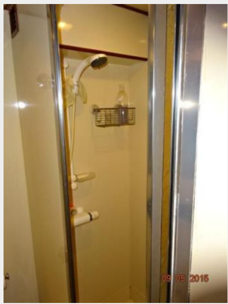
54' Ocean Alexander master stateroom shower