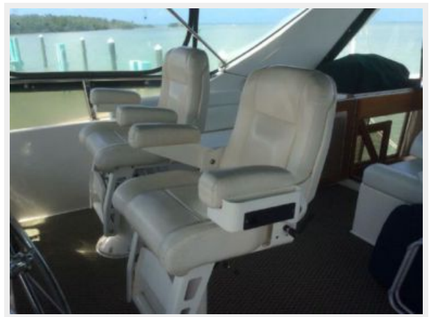
54' Ocean Alexander flybridge helmseats