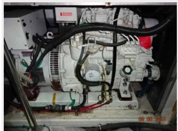
54' Ocean Alexander generator1