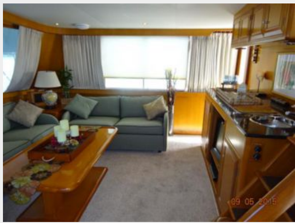
54' Ocean Alexander sundeck port