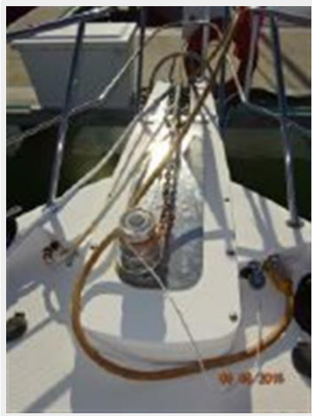
54' Ocean Alexander anchor windlass