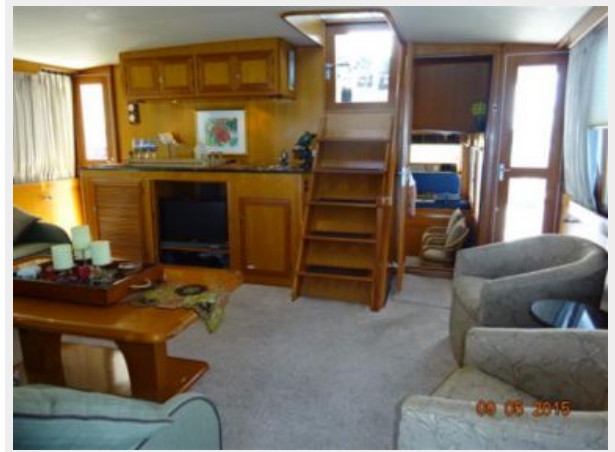
54' Ocean Alexander sundeck2