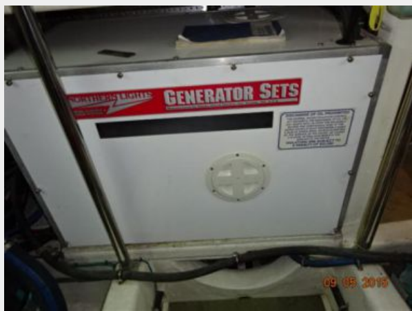
54' Ocean Alexander generator1 sound box