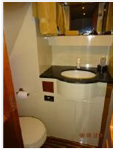
54' Ocean Alexander port guest stateroom head