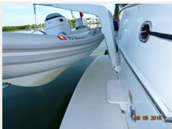
54' Ocean Alexander swimplatform