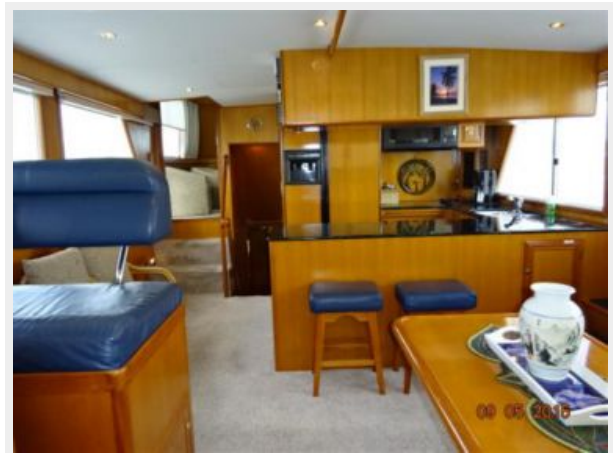
54' Ocean Alexander salon aft