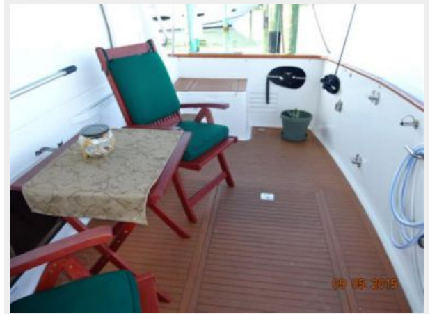
54' Ocean Alexander cockpit starboard