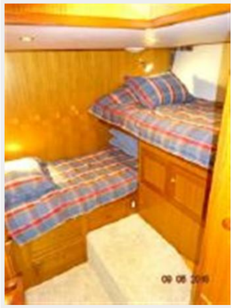
54' Ocean Alexander port guest stateroom