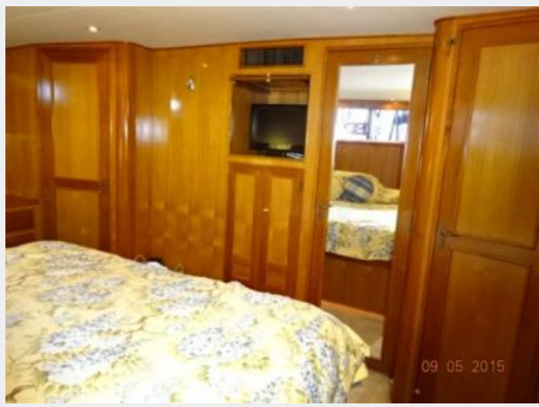
54' Ocean Alexander master stateroom forward