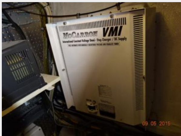
54' Ocean Alexander battery charger1