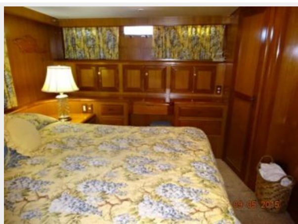
54' Ocean Alexander master stateroom port