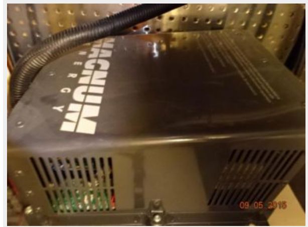
54' Ocean Alexander inverter