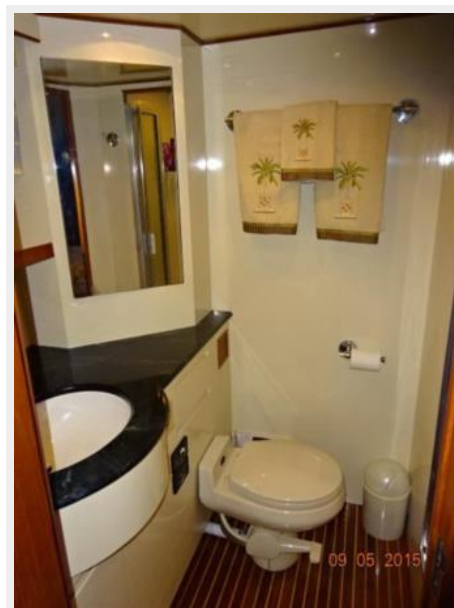
54' Ocean Alexander master stateroom head