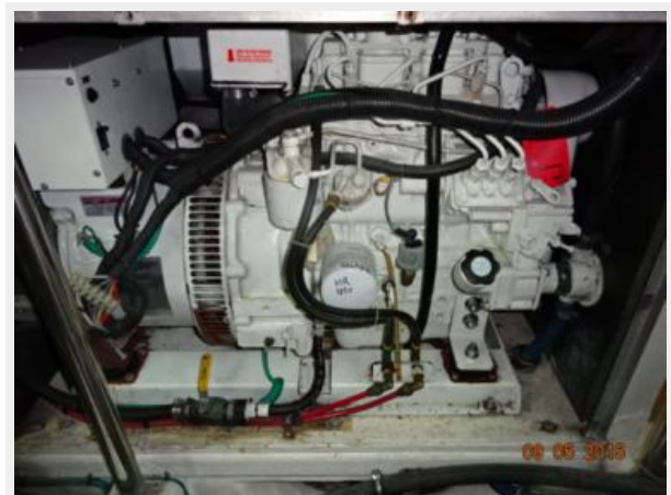
54' Ocean Alexander generator1