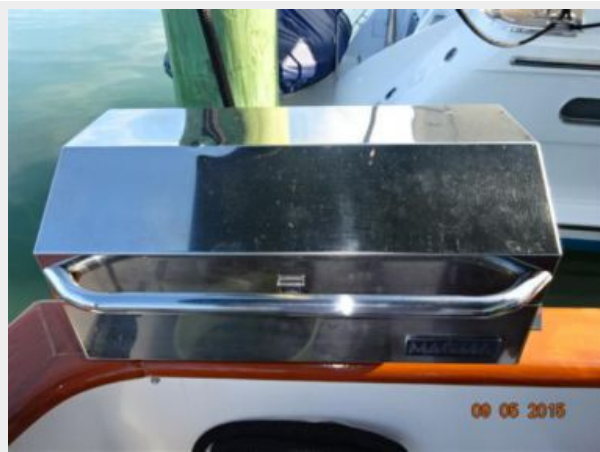
54' Ocean Alexander Magma BBQ grill