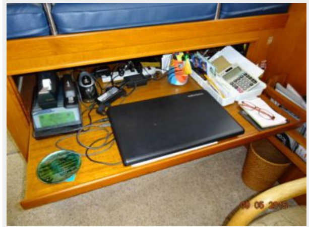
54' Ocean Alexander salon desk