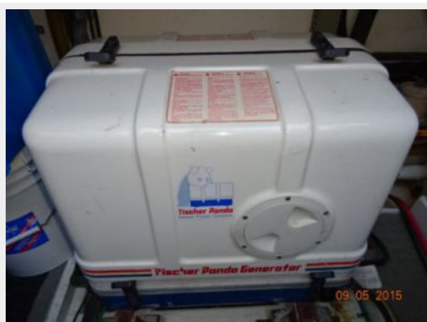
54' Ocean Alexander generator2 sound box