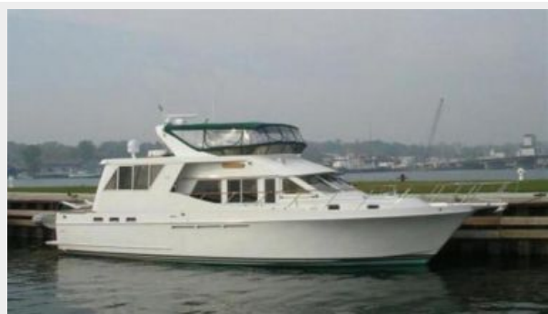
54' Ocean Alexander starboard profile