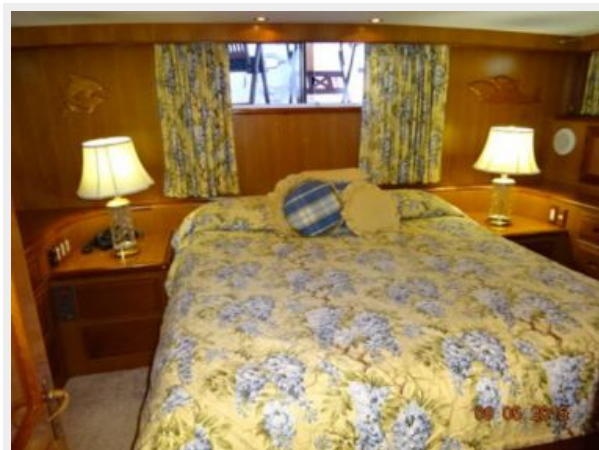
54' Ocean Alexander master stateroom