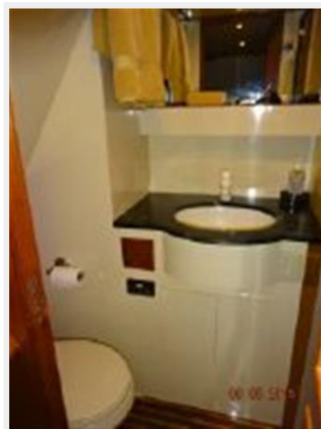
54' Ocean Alexander port guest stateroom head