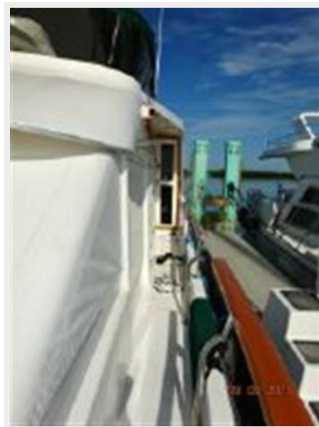
54' Ocean Alexander port side deck photo1