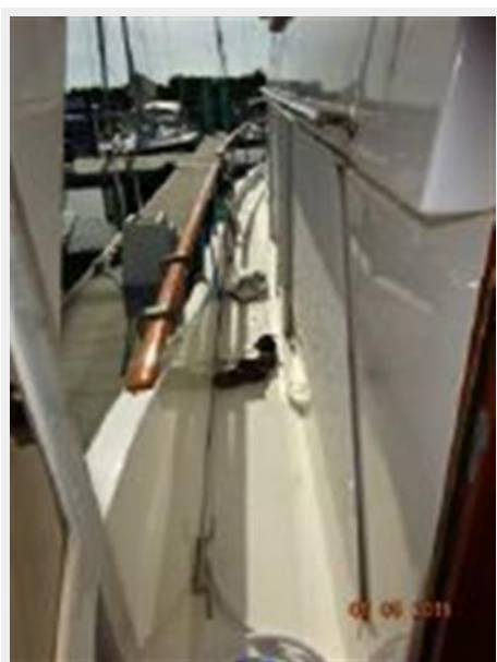
54' Ocean Alexander port side deck photo2