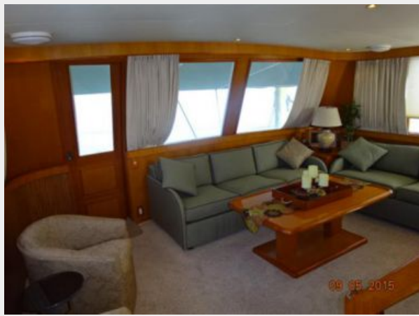
54' Ocean Alexander sundeck1