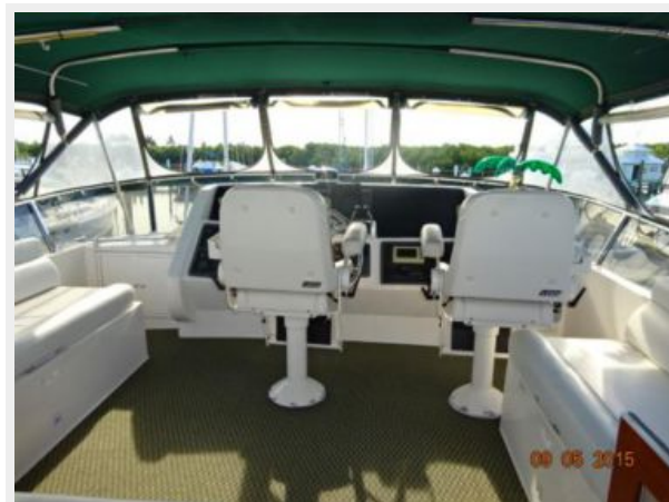
54' Ocean Alexander flybridge forward