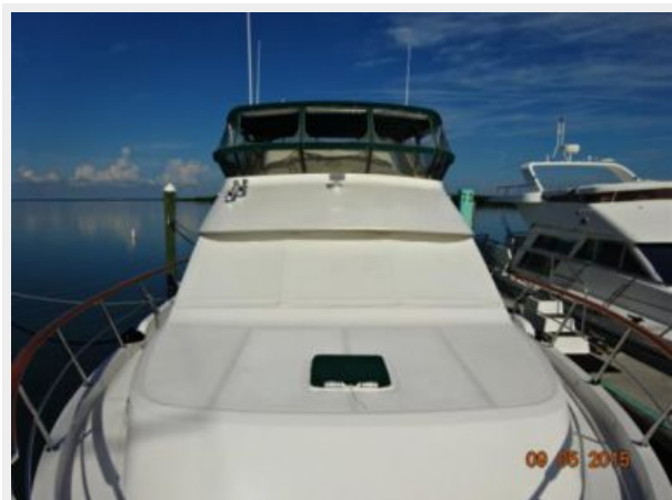
54' Ocean Alexander foredeck aft