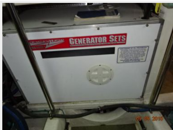
54' Ocean Alexander generator1 sound box