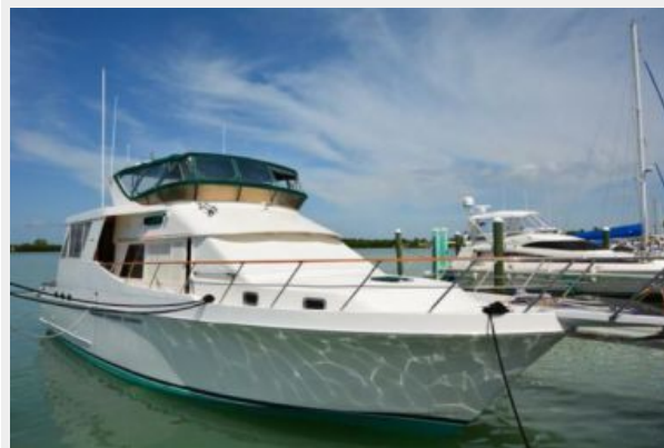
54' Ocean Alexander starboard forward profile