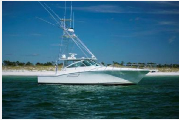
Starboard Profile 2