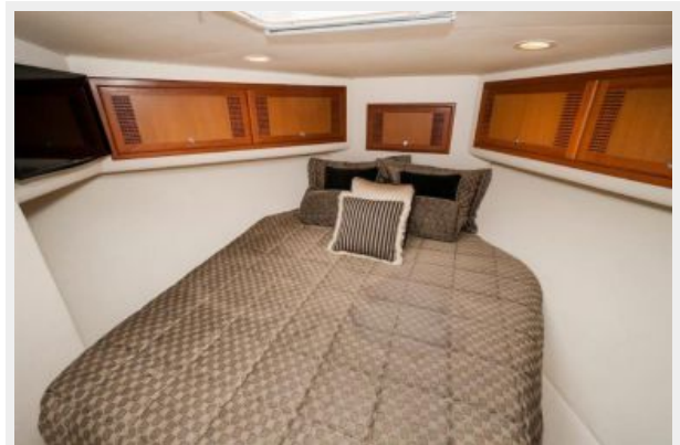
Master Stateroom 4