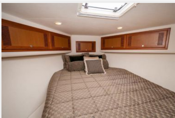
Master Stateroom 3