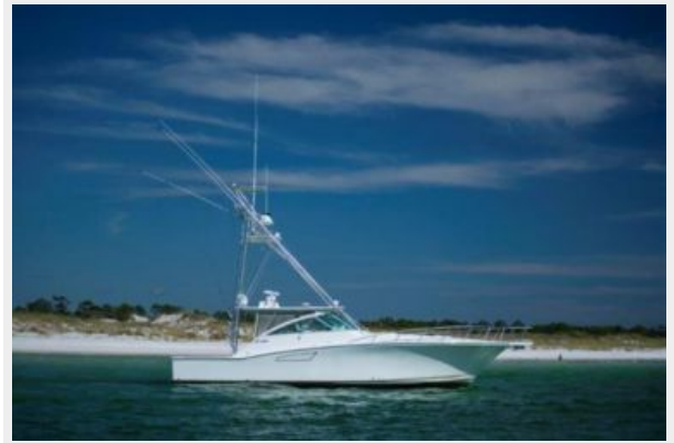
Starboard Profile 3