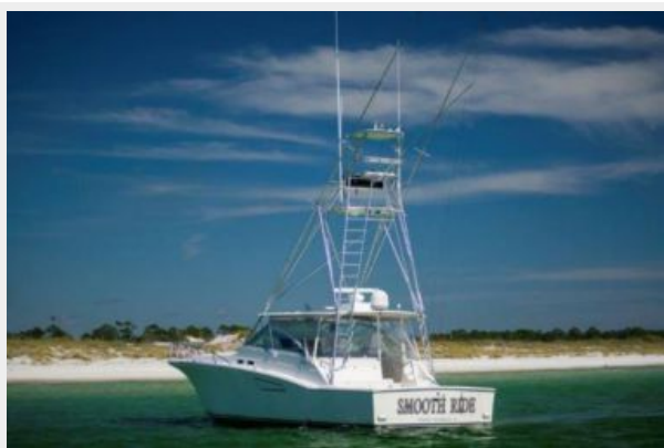
Aft Quarter Profile