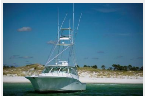
Forward Port Profile