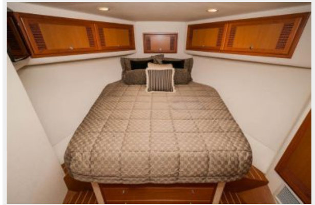
Master Stateroom 2