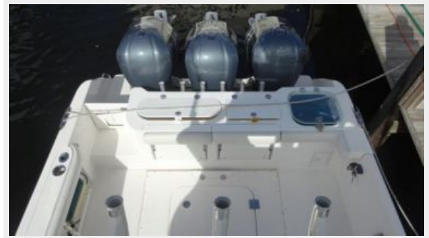
Cockpit / Engines