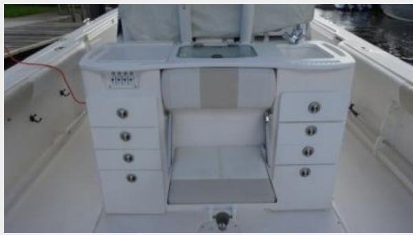
Tackle Station & Flip-down Fighting Chair