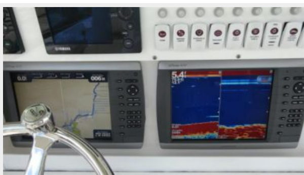
Lower Helm Electronics Detail