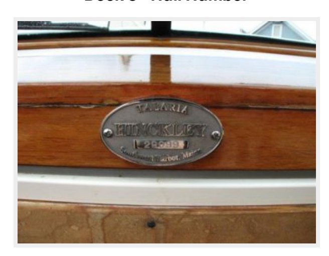
Deck 8 - Hull Number