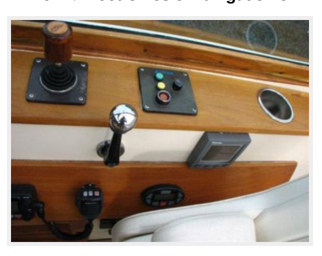
Helm / Electronics & Navigation 3