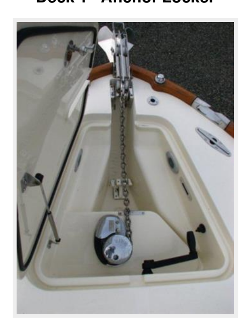
Deck 1 - Anchor Locker