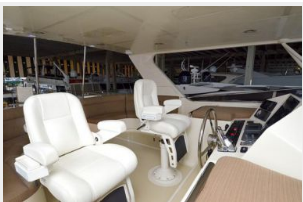
Port Looking Aft