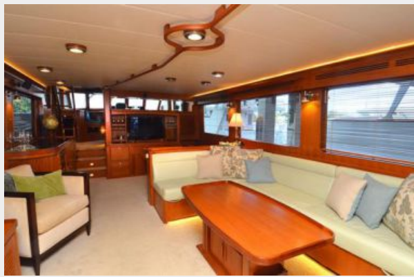
Salon Wine Cooler