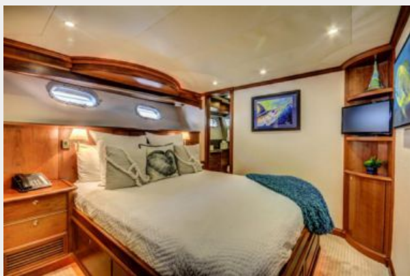
Queen Guest Stateroom, Midship