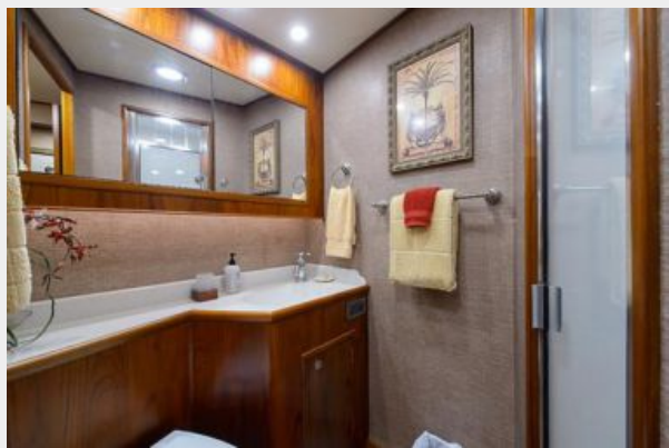
Port Guest Stateroom Head