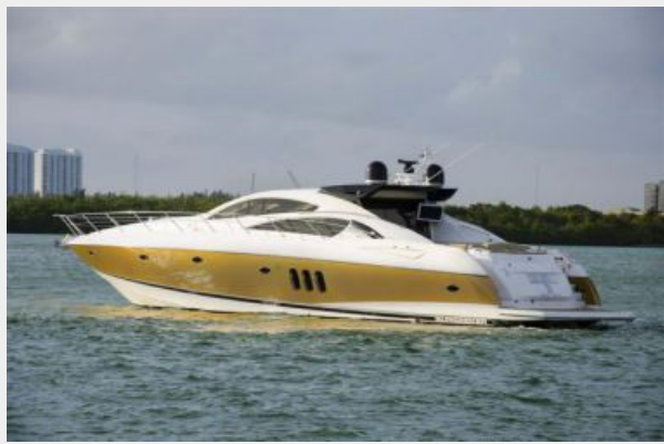
Hull wrap January 2016