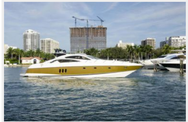
Hull wrap January 2016