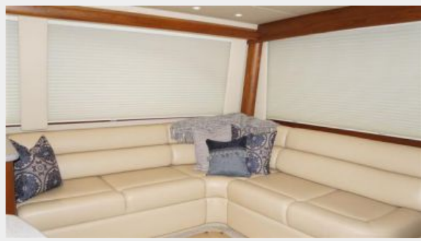
Salon Sofa & Sofa Bed