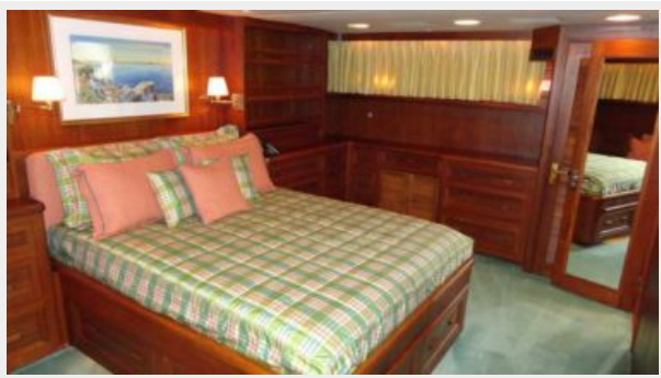
Owner's Cabin Port