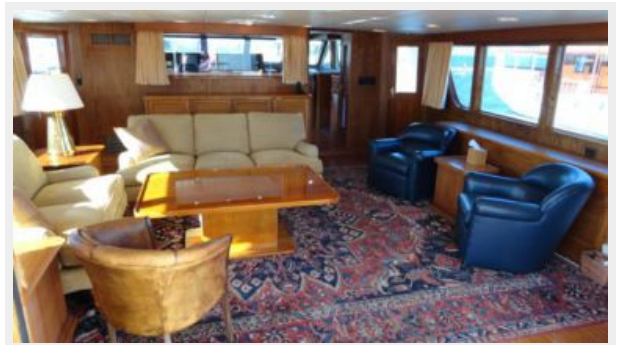
Main Salon Looking Fwd.