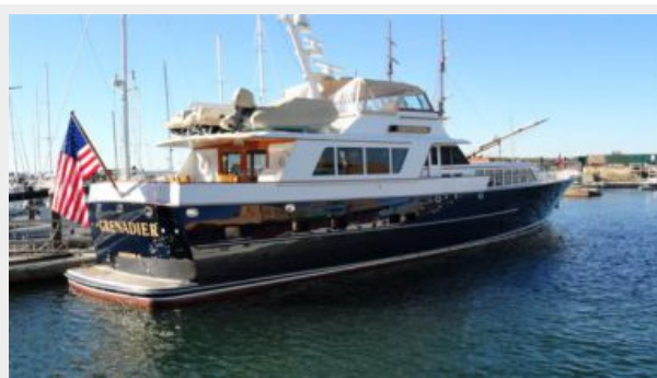
Stbd. Aft Quarter