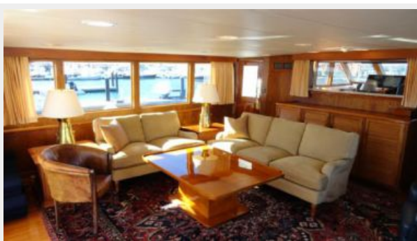
Main Salon Port