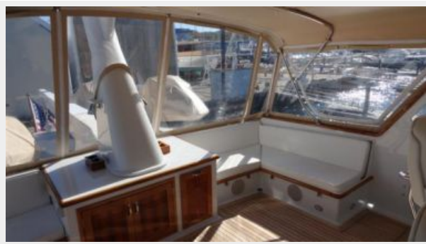
Flybridge Port Aft