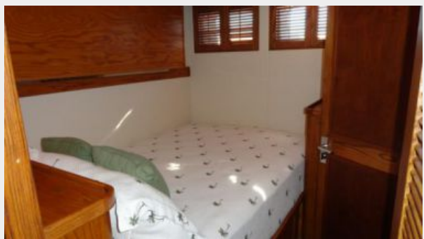
Port Guest Cabin