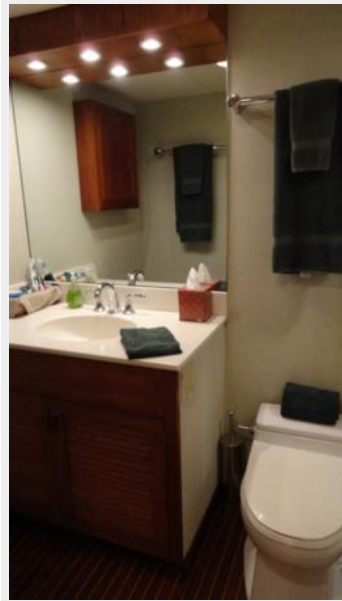
Stbd. Guest Head