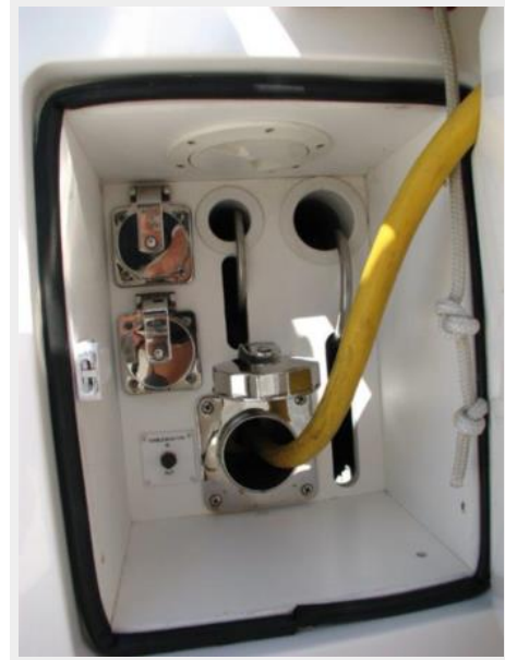
Deck 9 - Starboard Dockside Box