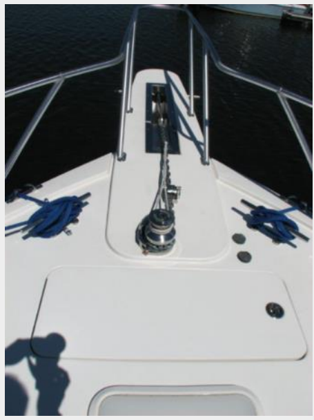
Deck 2 - Bow Pulpit