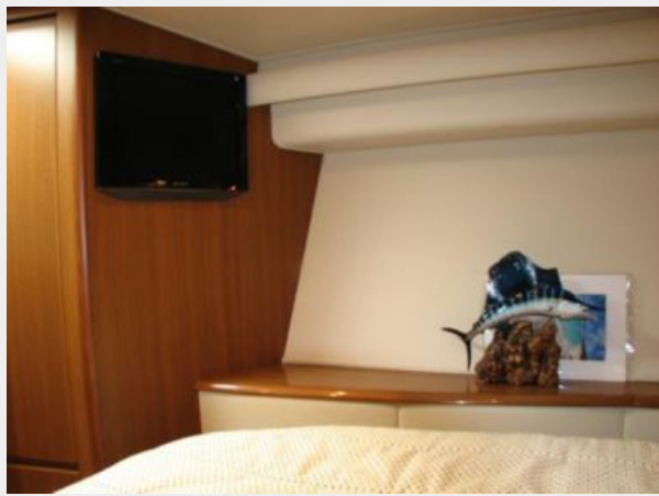
Master Stateroom 4 - TV