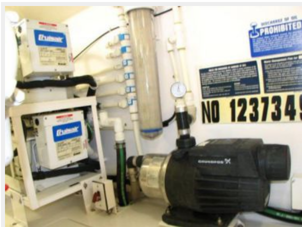
Engine & Mechanical Equipment 5 - Engine Room