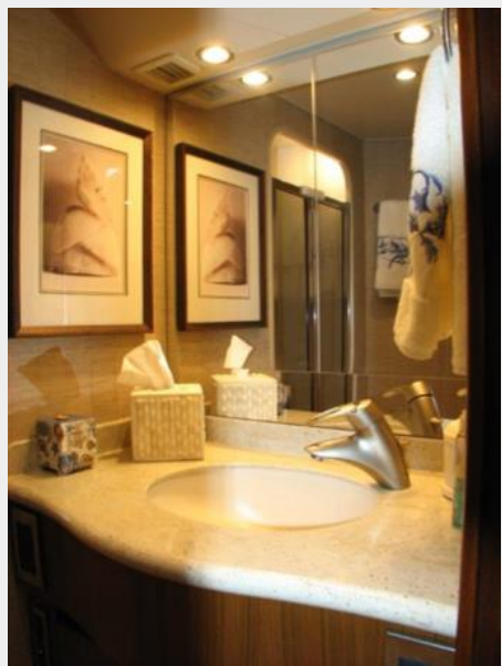
Master Head 1