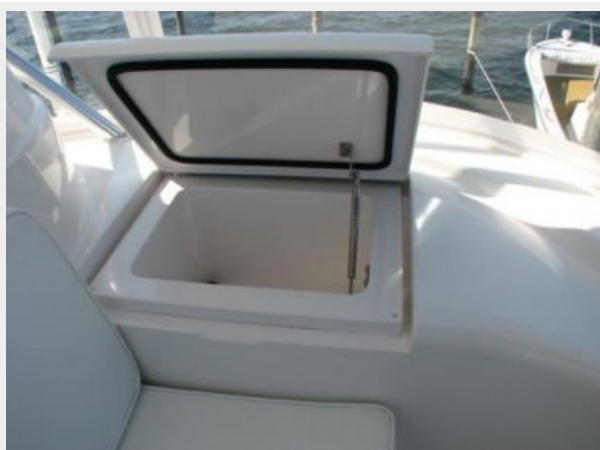
Deck 6 - Bridge Cooler