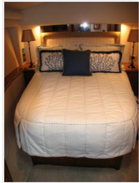
Master Stateroom 1