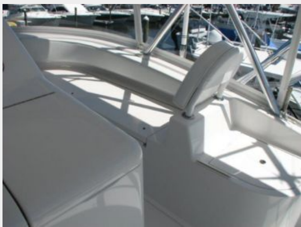
Deck 4 - Bridge