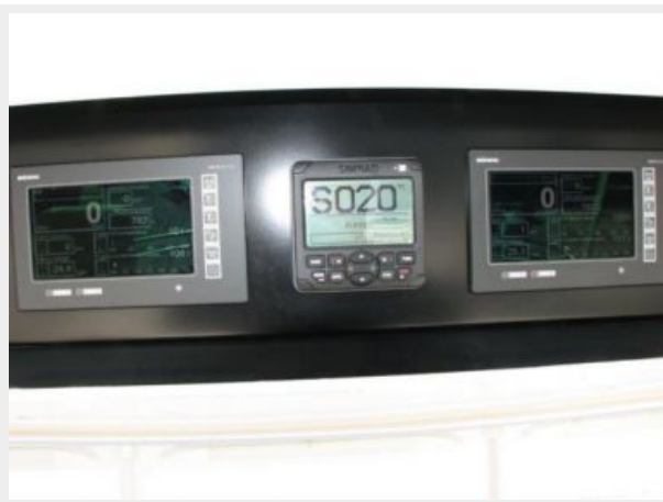
Helm / Electronics & Navigation 5 - Drop Down Radio Box