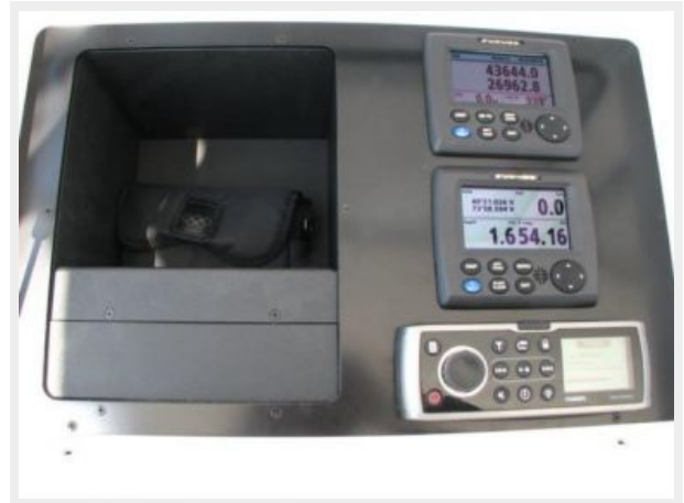
Helm / Electronics & Navigation 4 - Port Side Electronics Box