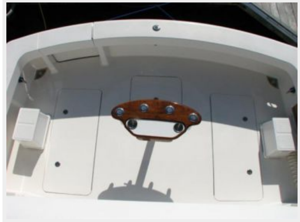
Cockpit / Fishing Equipment 1 - Cockpit