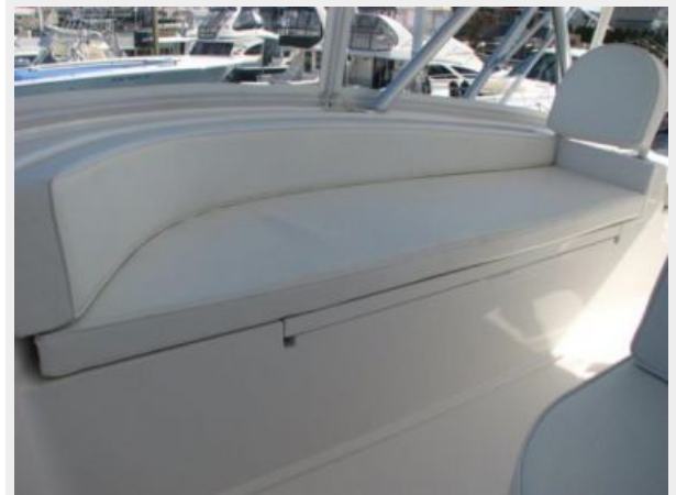
Deck 3 - Bridge Seating