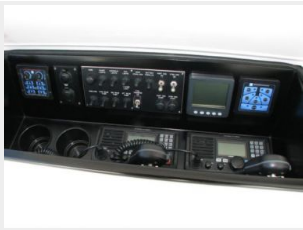
Helm / Electronics & Navigation 3 - Radio Box