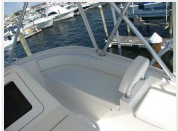
Deck 5 - Starboard Bridge Seating