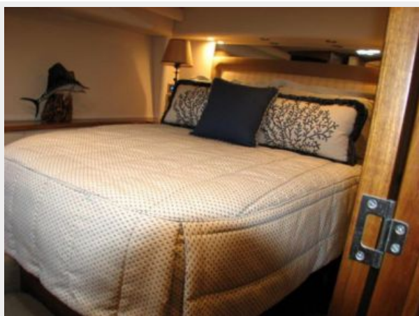
Master Stateroom 2