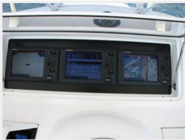
Helm / Electronics & Navigation 1 - Electronics