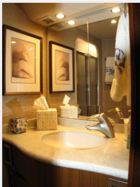
Master Head 1