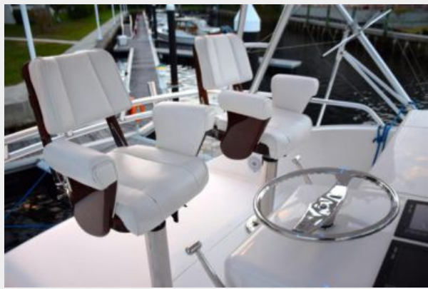
Custom helm chairs