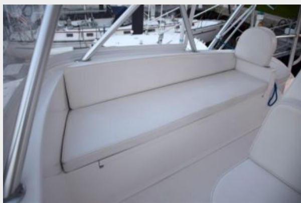
Stbd lounge area