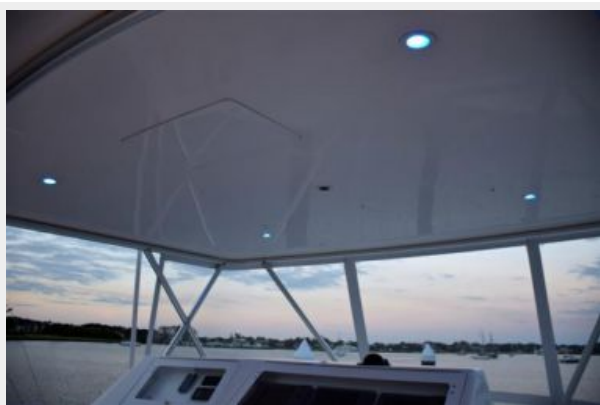
Hardtop LED lighting