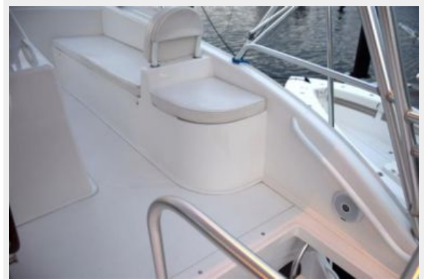
Stbd trolling seat