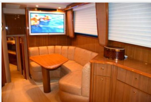
TV and dinette