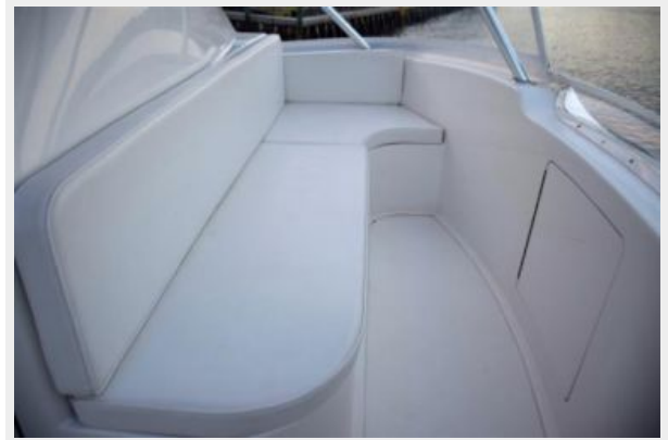
Flybridge forward seating