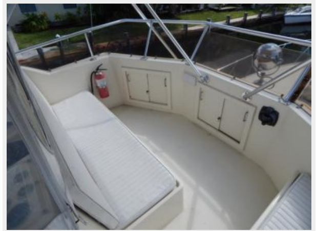
Flybridge Fwd Bench