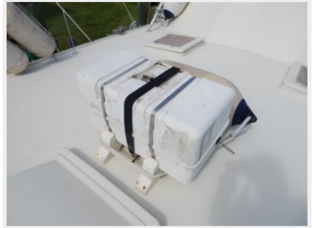
6 Man Liferaft