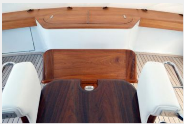
Release Marine Fighting Chair