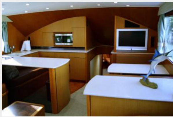
Well Appointed Salon