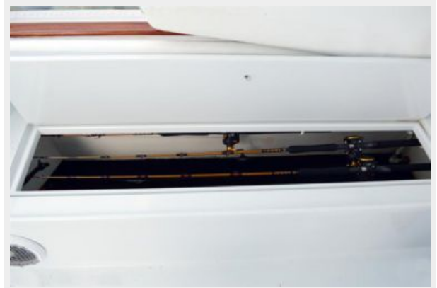
Rod Storage Under Bench Seating