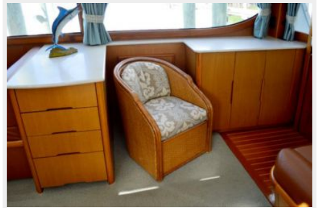
Custom Wicker Day Chair