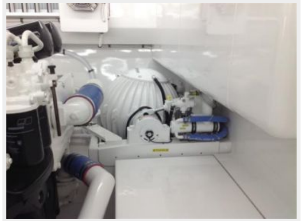
Engine Room - Custom Tool Box