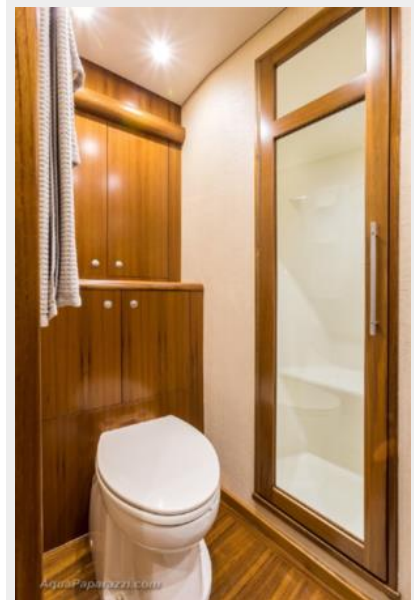
VIP Head - Port