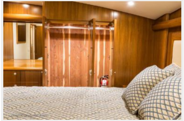
VIP Stateroom - Port