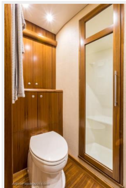
VIP Head - Port