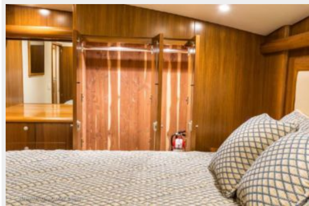
VIP Stateroom - Port