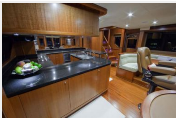
Galley / Pilothouse