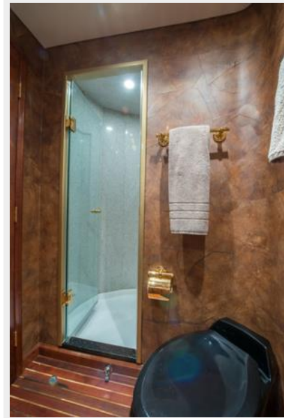
VIP Stateroom Head