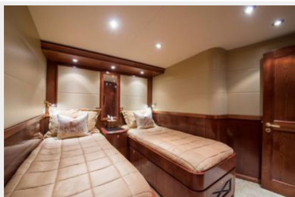
Guest Stateroom, Starboard