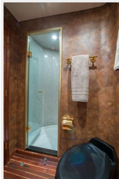
VIP Stateroom Head